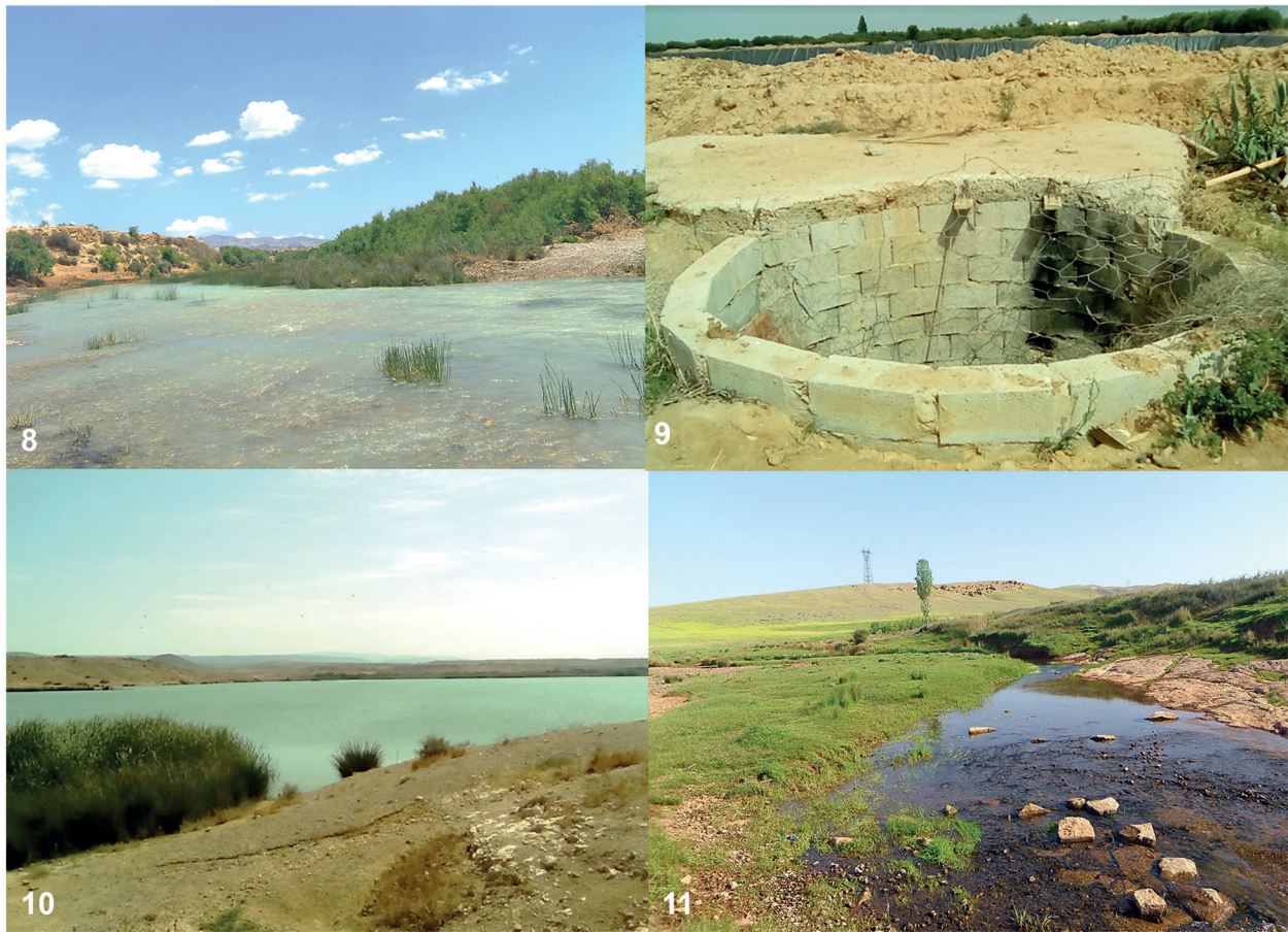
Figs 8–11. 8. Big section of the Moulouya River. 9. Typical well in the study area. 10. View of Ouled Settout reservoir. 11. Water-course from the Middle Atlas.

many species will probably have disappeared before being recorded or even described. Indeed, as in most of the Maghrebian territory, the regional aquatic ecosystems are increasingly threatened by human activities, through water abstraction, habitat loss and modification, industrial effluents, domestic sewage and agricultural runoff including fertilisers, pesticides and drainage of water (Bensaad et al. 2017; Mabrouki et al. 2017; Taybi et al. 2016, 2020b). Even worse, alien invasive species, potentially able to change the current biotic interactions in benthic communities, have been recorded recently from the hydro-systems of Morocco (Mabrouki et al. 2019a, b, c, 2020c; Taybi et al. 2020c, d, e), including molluscs, such as the Asian clam Corbicula fluminea (Müller 1774) and the New Zealand mudsnail Potamopyrgus antipodarum (Gray, 1843) (Taybi et al. 2017; Taybi et al. 2021). These invasive species could be a serious problem for the native aquatic biodiversity. Therefore, monitoring the presence and distribution of species, as well as studies improving their biological and ecological knowledge, are of crucial concern in promoting the conservation of the Moroccan freshwater biodiversity.