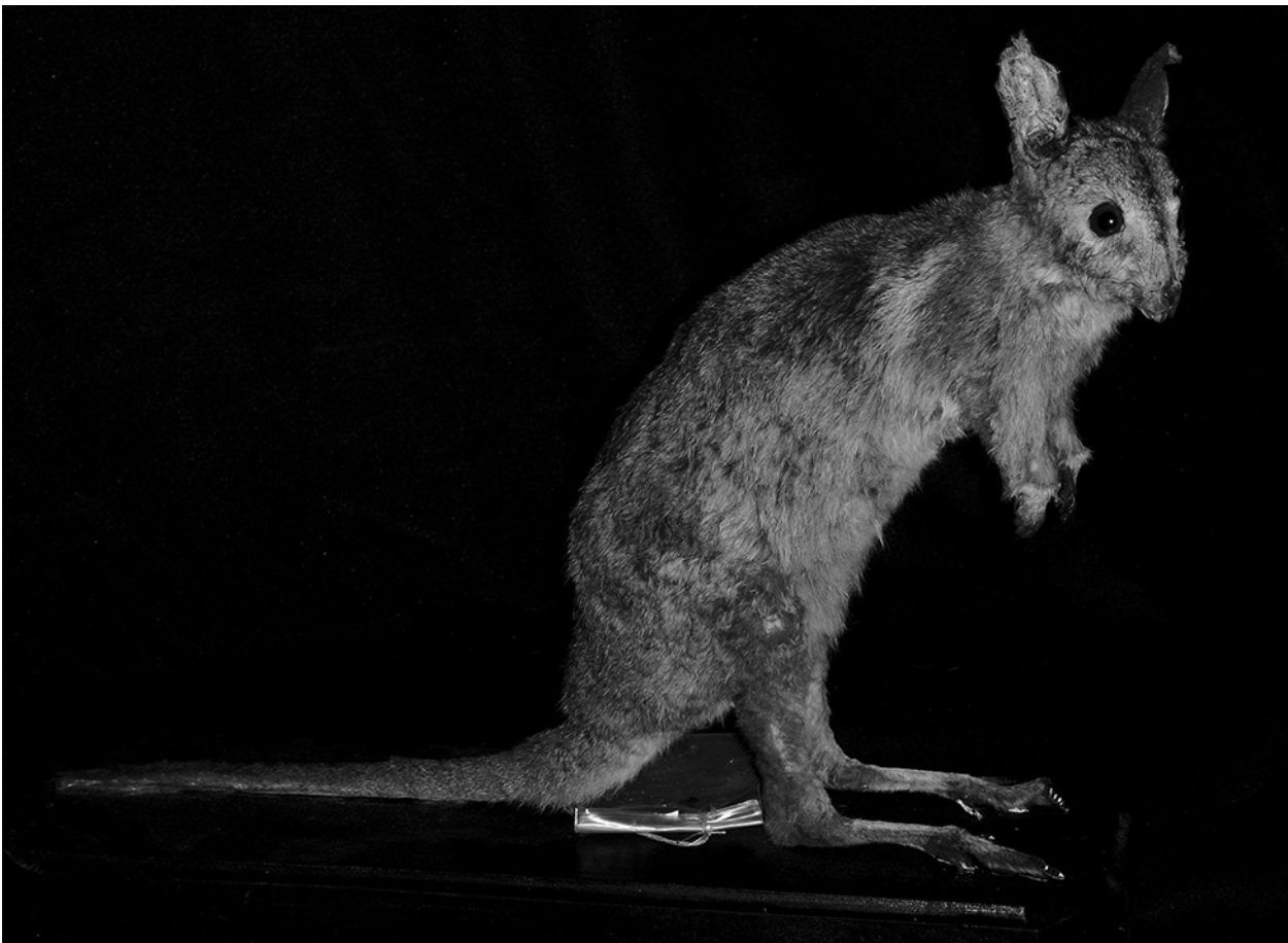
Fig. 6. MZUT T520 specimen of Crescent Nail Wallaby Onychogalea lunata .