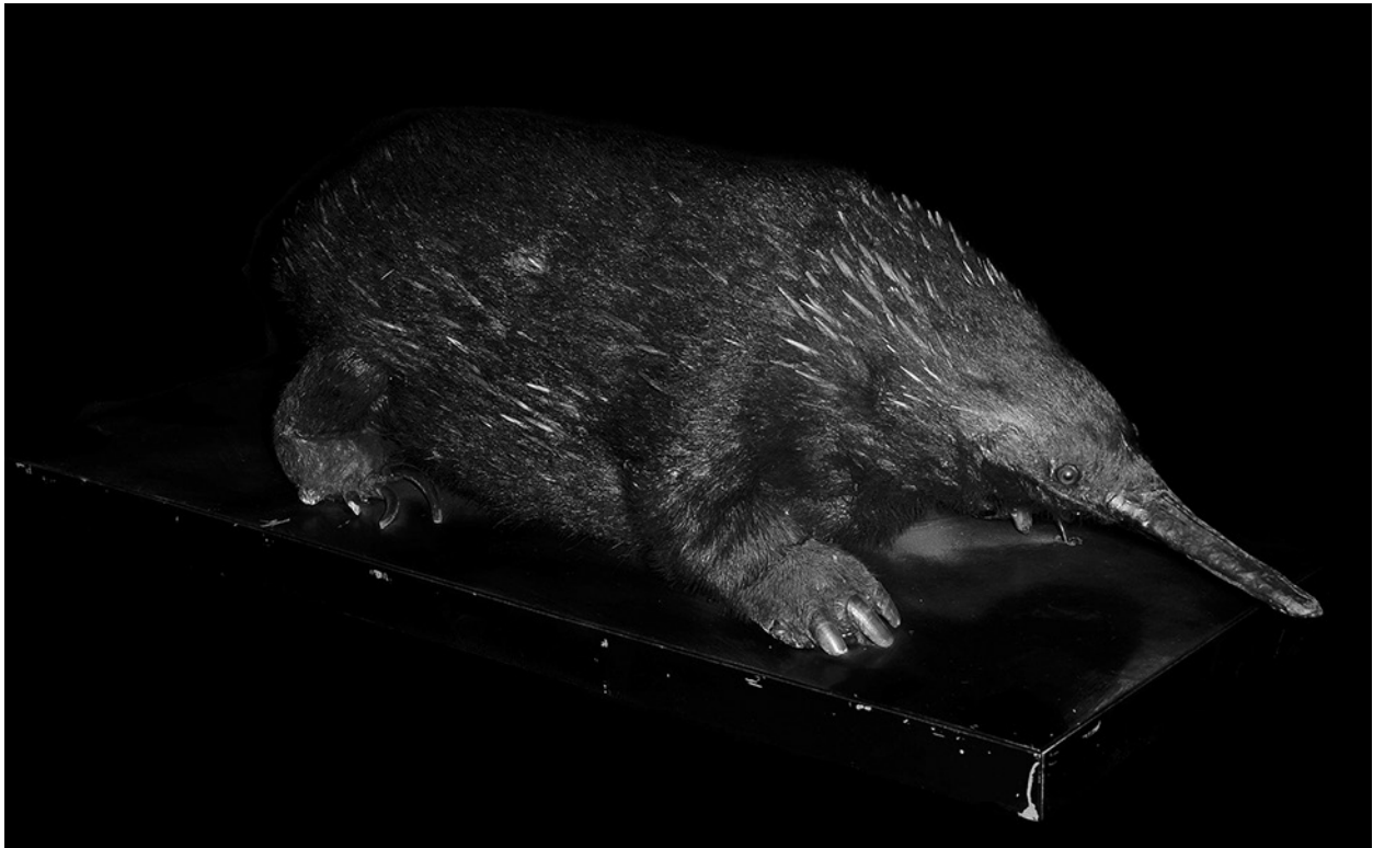
Fig. 2. MZUT T405 specimen of Western Long-Beaked Echidna Zaglossus bruijnii .

specimens and built up a very large private collection, in particular of birds (more than 20,000 specimens) which, after his death, were donated to the Natural History Museum of Milano. Unfortunately, after the bombing in 1943, the collection was almost completely destroyed.