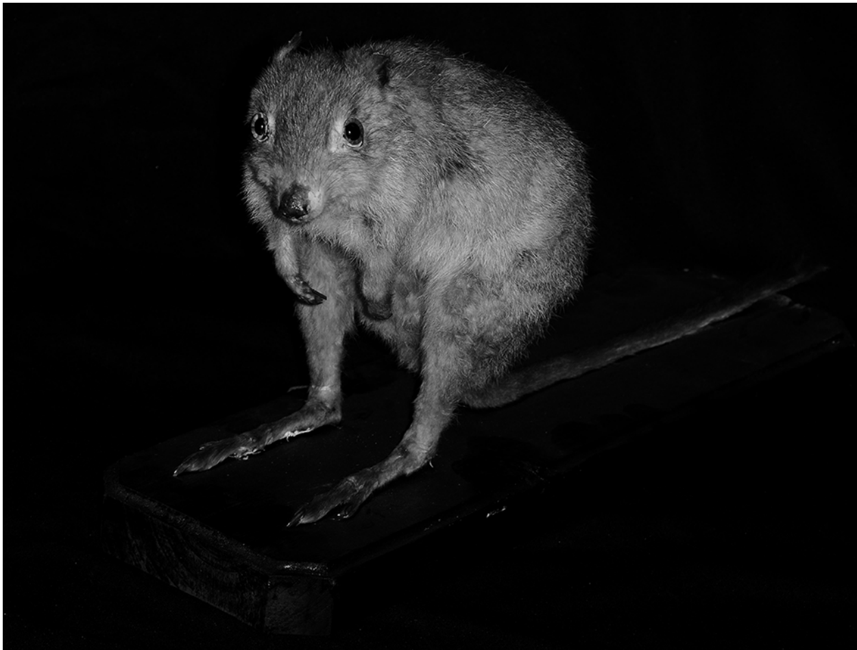
Fig. 4. MZUT T512 specimen of Wolye Bettongia penicillata .

MZUT T504; skin; unsexed ad.; Gosford, New South Wales, Australia; 1893; by G. Podenzana.