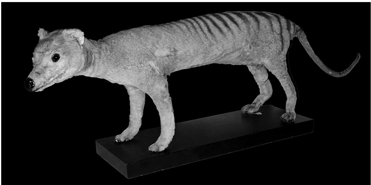
Fig. 3. MZUT T480 specimen of Tasmanian Tiger Thylacinus cynocephalus .

MZUT T494 (807); mount; unsexed ad.; Australia; 1845; purchased by G.A. Frank;