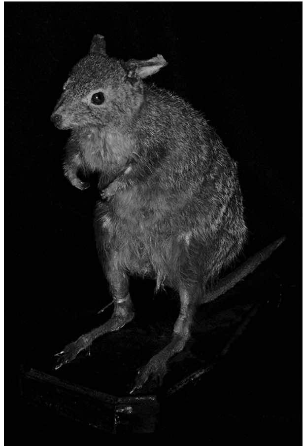
Fig. 5. MZUT T514 specimen of Eastern-Hare Wallaby Lagorchestes leporides .

MZUT T514; mount; unsexed ad.; Australia;