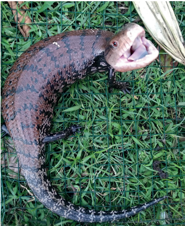
Fig. 4. Defensive posture of Tiliqua gigas from Northern Sulawesi, Indonesia. Note the blueish tongue stretched out towards potential predators.

Sulawesi site. This gap implies a crossing of the biogeographically important Weber Line running east of Sulawesi and separating the Oriental and Oceanian faunas (Weber 1902; Lohman et al. 2011; Holt et al. 2013; Vilhena & Antonelli 2015).