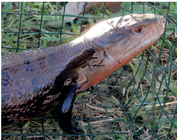
Fig. 2. Photography of the living specimen of Tiliqua gigas gigas found near Airmadidi in Northern Sulawesi, Indonesia.

Some old mentions of bluetongue skinks from Java and Sumatra (Boulenger 1887; Duméril & Bibron 1839; Werner 1910) remained unconfirmed and were most likely caused by misidentification of collection data or providing the location of the port of shipment (Shea 2000a).