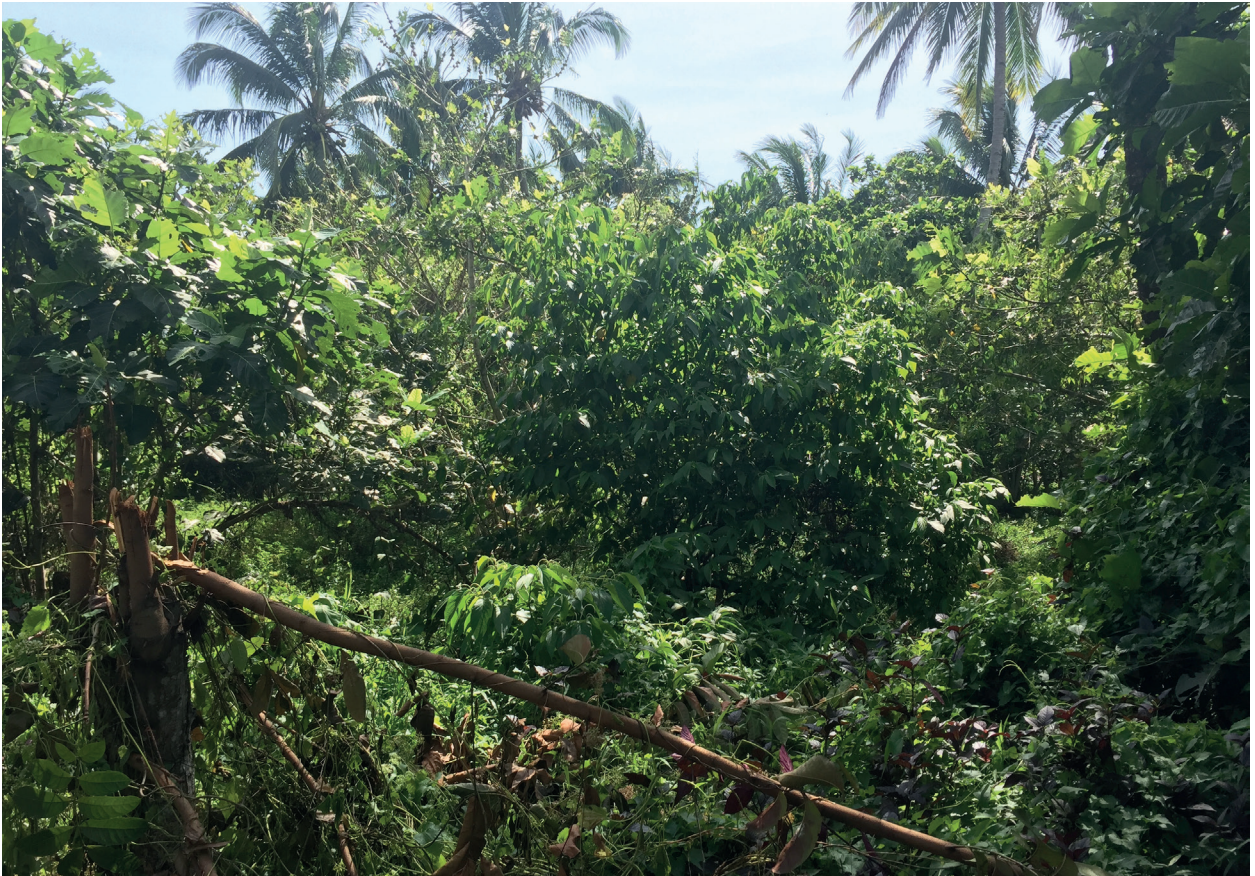
Fig. 3. Habitat in which Tiliqua gigas was found in Northern Sulawesi.