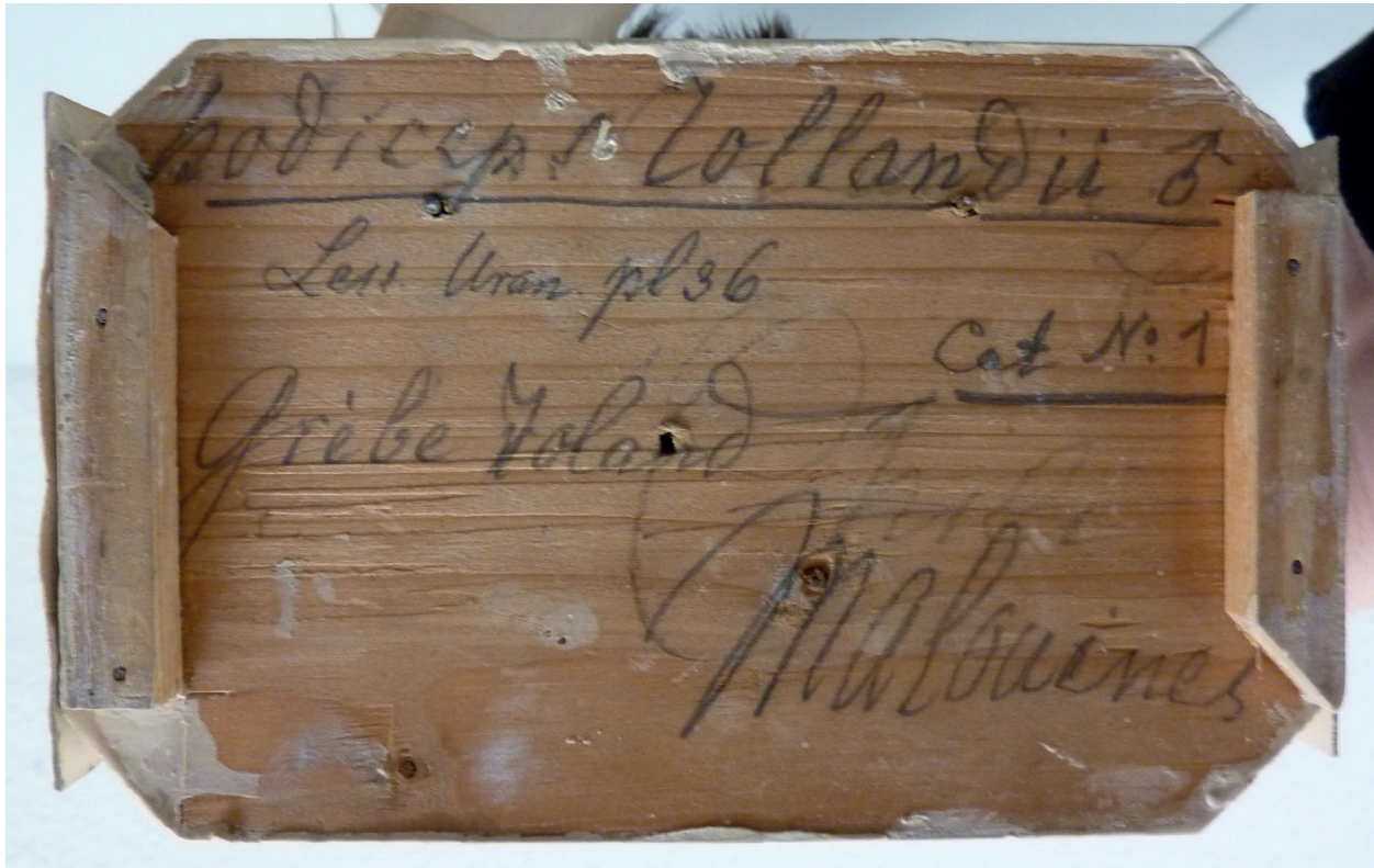
Fig. 2. White-tufted Grebe Rollandia rolland rolland (RMNH.AVES.107453), Pedestal underside (photograph by Justin Jansen, 18 December 2012; © Naturalis Biodiversity Center, Leiden).

tant, accessed 18 December 2012. Tax: mounted. Pub: Abbott 1860, 1861; Gould 1859, Schlegel 1867; Sclater 1860, 1861, 1862.