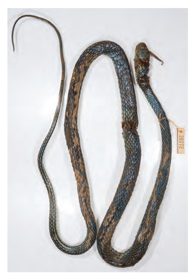
Fig. 3. Hapsidophrys lineata (ZFMK 2626072) from Kajiko North, South Sudan (locality no. 1 on Fig. 1).

Voucher specimen . South Sudan: south of Yei, Mt. Korobe, collected by G. Nikolaus, 28 July 1978 (ZFMK 26059; Fig. 2).