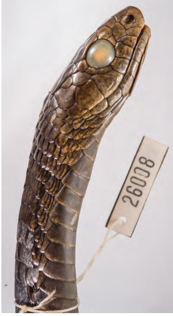
Fig. 4. Thrasops jacksonii (ZFMK 26008) from between Katire and Talanga, South Sudan (localities nos. 4 and 5 on Fig. 1).

Remarks. Spawls et al. (2002) listed this widely distributed forest species for Uganda, Kenya, DR Congo, elsewhere south-westwards to northern Angola and westwards to Guinea. Schmidt (1923), Pitman (1974) and Broadley & Howell (1991) reported this species also for Tanzania. In Uganda, this species is more widely distributed in the southwest of the country; otherwise there are only a few scattered records near Entebbe and in the Mabira and Budongo forests (Spawls et al. 2002). Our voucher specimen from south of Yei (Fig. 3) represents, therefore, a considerable range extension to the north and not simply a border-crossing continuation of the Ugandan distribution range.