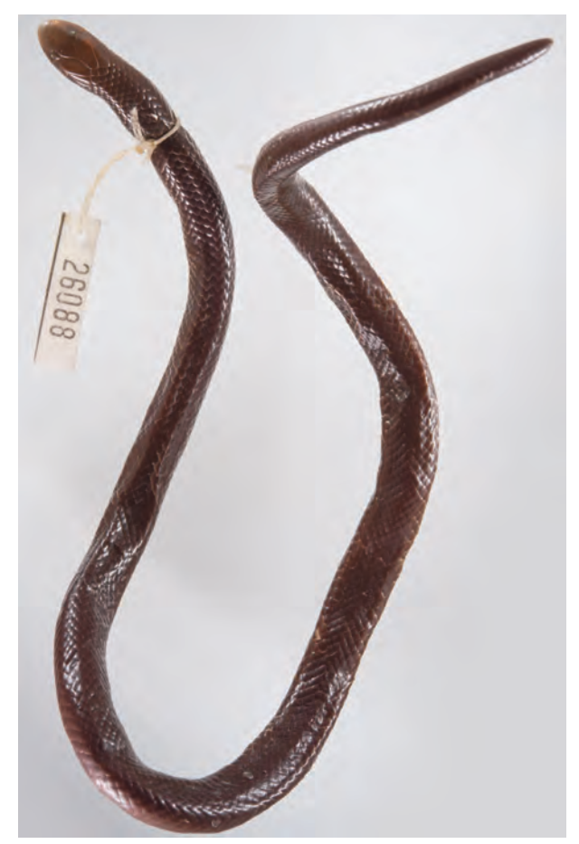
Fig. 6. Amblyodipsas unicolor (ZFMK 26088) from Gilo, South Sudan (locality no. 6 on Fig. 1).

Voucher specimen . South Sudan: Talanga-Forest (Kinyeti), collected by H. Rupp, July 1978 (ZFMK 26030). Remarks . Spawls et al. (2002) listed this forest and woodland species (as Boiga pulverulenta ) for Kenya, Uganda and the DR Congo, elsewhere westwards to Guinea and south-westwards to northern Angola. This confirms data from Pitman (1974) and Chippaux (2001). The Ugandan localities listed by Spawls et al. (2002, see also the map by these authors) leave the northern third of the country without records. Thus, again in this case, the geographic distance to the new South Sudanese locality of the specimen ZFMK 26030 (Fig. 5) is remarkable.