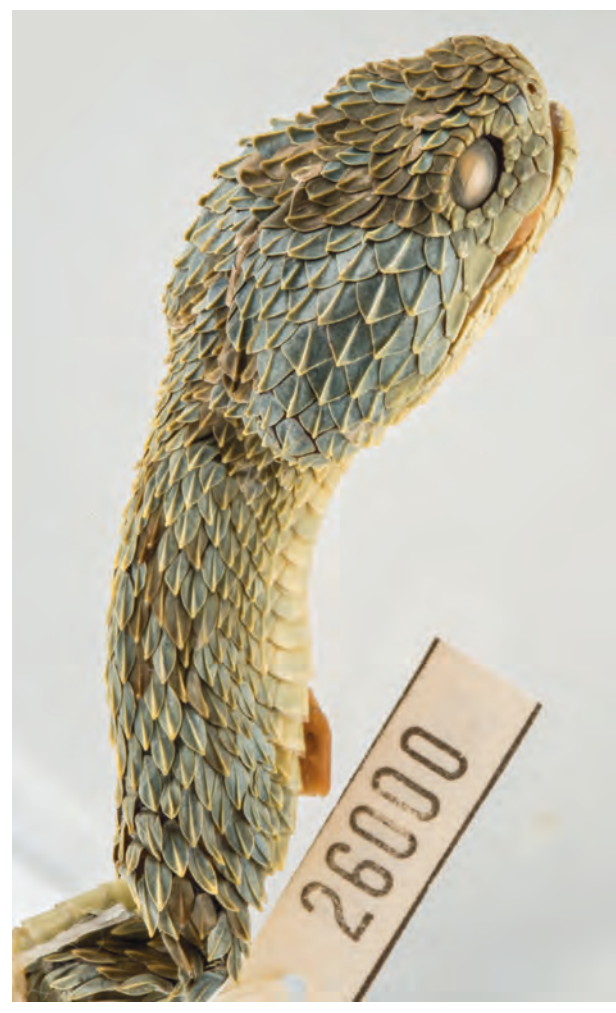
Fig. 7. Atheris squamigera (ZFMK 26000) from Iwatoka/Watoka, South Sudan (locality no. 2 on Fig. 1).