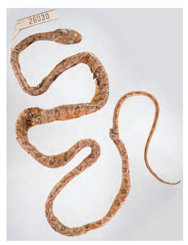
Fig. 5. Toxicodryas pulverulenta (ZFMK 26030) from Talanga Forest, South Sudan (locality no. 4 on Fig. 1).