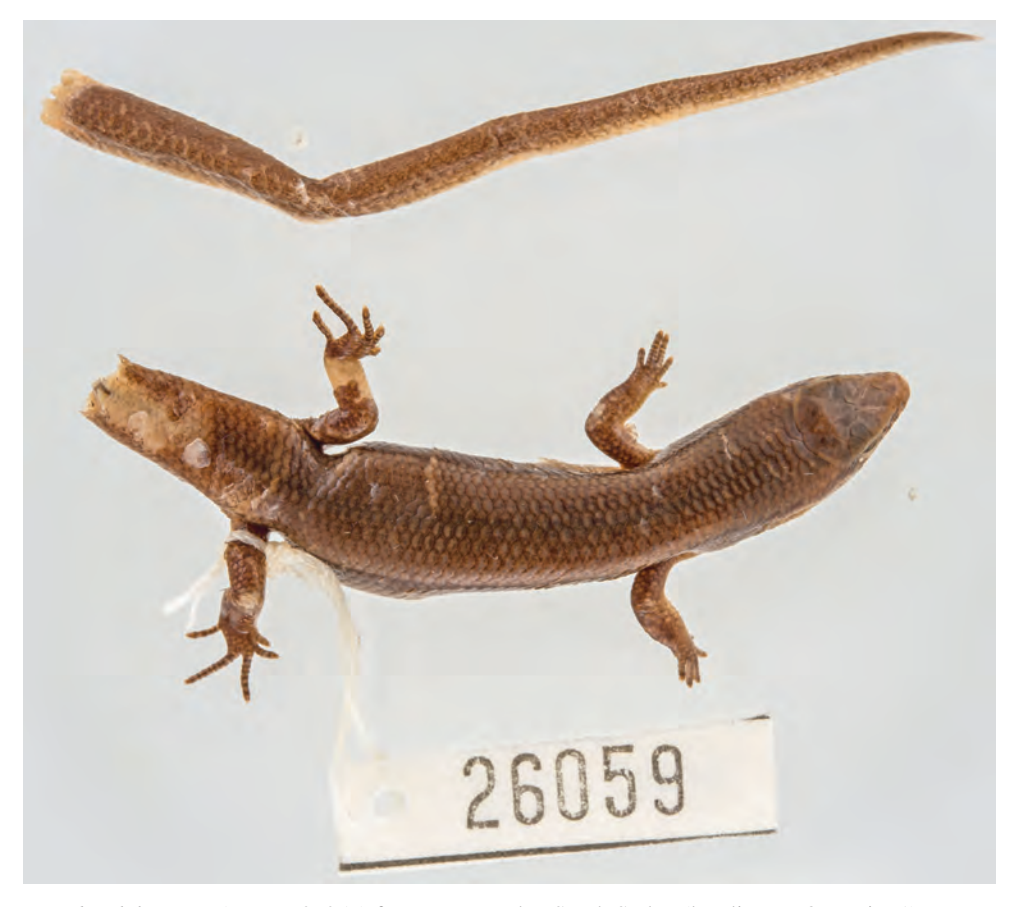
Fig. 2. Leptosiaphos kilimensis (ZFMK 26059) from Mt. Korobe, South Sudan (locality no. 3 on Fig. 1).