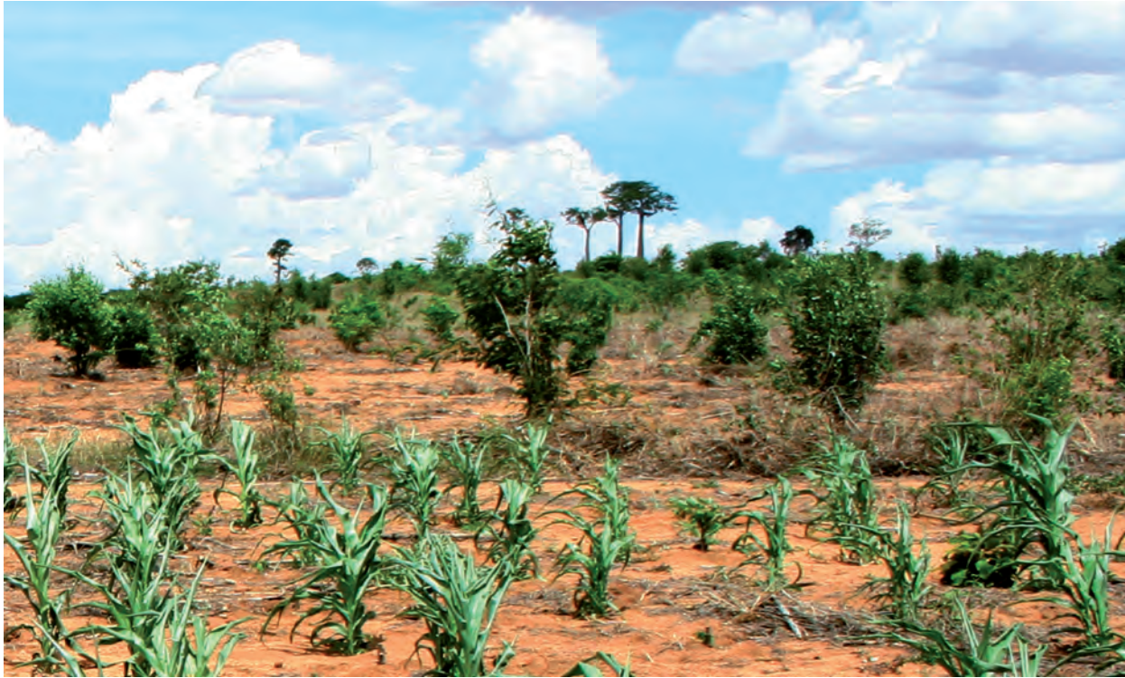
Fig. 1. Habitat of Voeltzkowia rubrocaudata : corn plantation (in foreground) near the village of Andranomaitso, Commune rurale de Sakaraha.