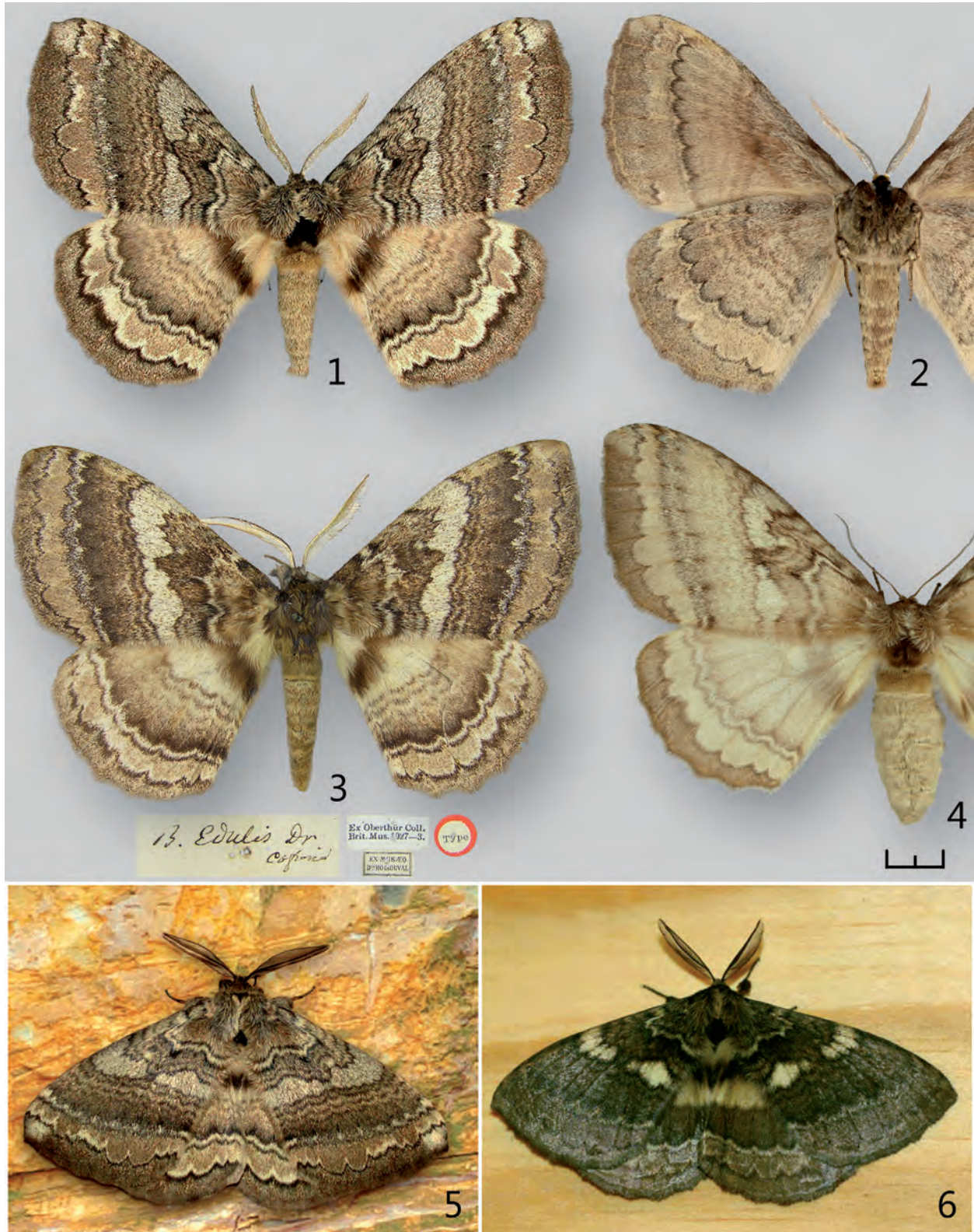
Figs 1–6. Habitus of Striphnopteryx edulis adults. 1. male, South Africa, KwaZulu-Natal, Ramsgate Butterfly Sanctuary, reared specimen, upperside; 2. ditto, underside; 3. holotype male, BMNH; 4. female, same data as 1, reared specimen, upperside; 5. same male as in 1), newly eclosed, in resting posture; 6. dark male, Zimbabwe. (scale bar 10 mm).