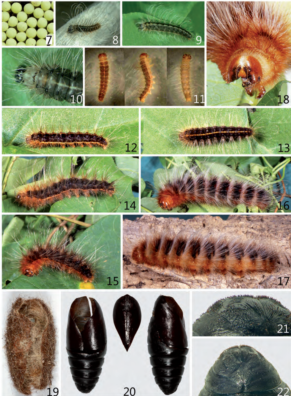
Figs 7–22. Preimaginal stages of Striphnopteryx edulis . 7. eggs; 8. L1 shortly after hatching; 9. L1 after feeding; 10. anterior part of L1 in pre-moulting phase, showing bulging pronotal shield; 11. L2 fixed in ethanol; dorsal, lateral and ventral views; 12–13. L2; lateral and dorsal views; 14. L3; 15. L4; 16. L5; 17. L6; 18. head of L6, frontal view; 19. cocoon; 20. pupa after eclosion; dorsal, ventral (head shield only) and lateral views; 21. caudal end of pupa, ventral view, showing densely denticulate apex; 22. same, less enlarged.