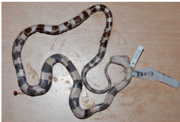
Fig. 5. Ventral view of Lycodon fasciatus . CIB 9804, from Ruili City, Yunnan. Note the whitish colouration of the anterior part and the speckling of the posterior part.

Dentition. A total of 10 maxillary teeth, with the following formula: 4 small anterior teeth + 2 strongly enlarged teeth + a wide gap + 2 small teeth + a small gap + 2 strongly enlarged, posterior teeth.