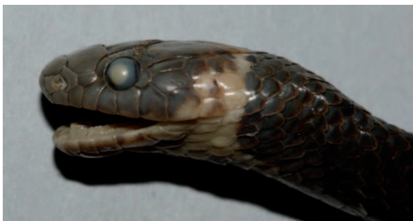
Fig. 3. Lateral view of the right side of the head of preserved holotype of Lycodon synaptor sp. n., BMNH 1905.1.30.63 from Dongchuan, 100 km north of Kunming, Yunnan Province, People's Republic of China.

Diagnosis. A species of the genus Lycodon characterized by: (1) loreal scale not entering orbit; (2) 15–17 dorsal scale rows at the forepart of the body and 17 dorsal scale rows at midbody; (3) upper and vertebral dorsal rows (6–7) keeled; (4) 201–203 ventrals in females, males unknown; (5) 68–69 Sc in females, males unknown; (6) a relative tail length of about 0.189–0.192 in females, males unknown; (7) 8 supralabials with SL 4–6 touching the orbit (7) 30–31 narrow white bands on a dark body; (8) width of the first band vertebral 0.5–1.0 scales, on the base 3 ventrals; and (9) the belly with discreet bands throughout.