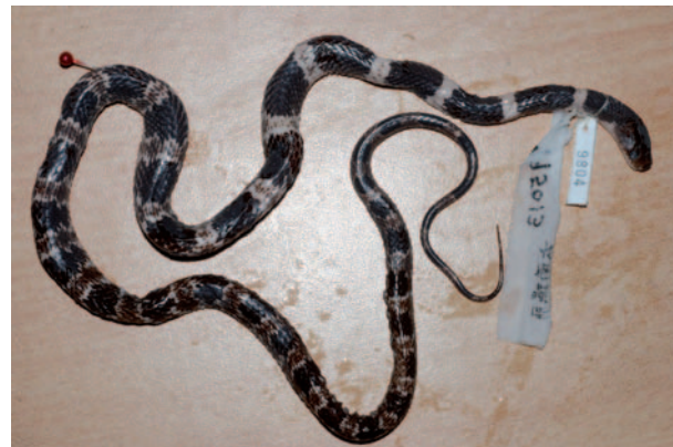
Fig. 4. Dorsal view of Lycodon fasciatus . CIB 9804, from Ruili City, Yunnan. Note the irregular bands.

Detailed comparisons with other species of the genus Lycodon appear below in the Discussion.