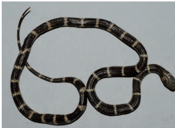
Fig. 1. Dorsal view of preserved holotype of Lycodon synaptor sp. n., BMNH 1905.1.30.63 from Dongchuan, 100 km north of Kunming, Yunnan Province, People's Republic of China.