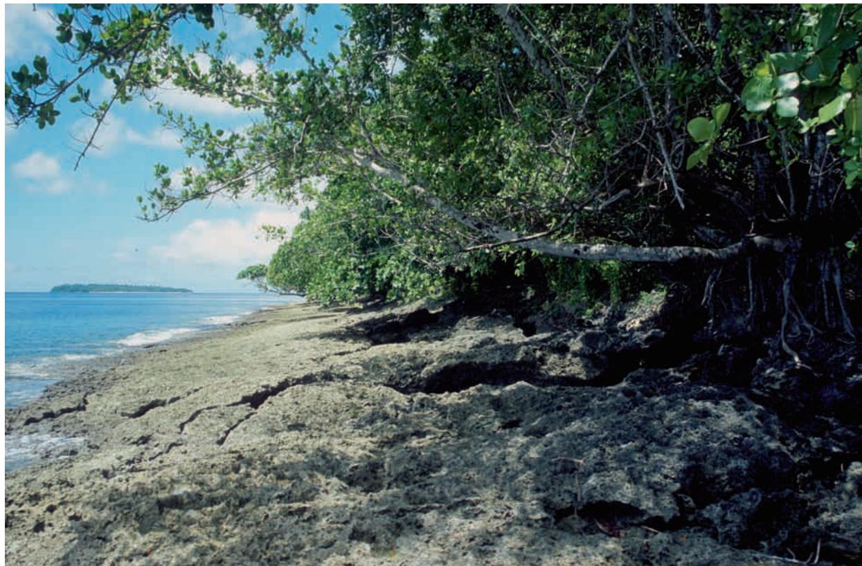
Fig. 2. Coast line with coral limestone deposits on Salibabu Island. Habitat of Varanus sp. and Emoia a. atrocostata .

The geographically isolated position between three biogeographic subregions in the centre of the Indo-Australian Archipelago render the Talaud Islands an interesting field of research for biogeographers. Until recently, however, the Talaud Archipelago (together with Sangihe) has been one of the least-known areas of the Sulawesi region as defined by VANE-WRIGHT (1991). Hence, due to their minor geographic size together with their remote location, the Talaud Island group has been paid only little attention by herpetologists in the past and scientific literature about the herpetofauna of this small archipelago is scarce. VAN KAMPEN (1907; 1923) and DE ROOIJ (1915; 1917) provided the first herpetological data about the Talaud Islands based on material collected by M. WEBER during the Siboga Expedition of 1899. DE ROOIJ (1915; 1917) listed five different lizard species ( Calotes jubatus , Varanus indicus , Lygosoma cyanurum , Lygosoma rufescens , and Mabuia multicaarinata ) and one snake species ( Candoia carinata ). Later, DE JONG (1928) published the results of another small collection by the Dutch botanist H. J. LAM who visited Karakelong and Salibabu as well as Miangas, a small islet south of Mindanao, in 1926 (LAM 1926; 1942). His Talaud collection comprised ten different species representing eight lizards and two snakes. Voucher specimens by M. WEBER and H. J. LAM from the Ta-