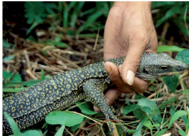
Fig. 14. Varanus sp. from Salibabu Island.

Material examined: MZB Lac. 5176 (AK067), MZB Lac. 5177 (AK064), MZB Lac. 5178 (AK059), MZB Lac. 5179 (AK066), MZB Lac. 5180 (AK065); MZB Lac. 581 (954),