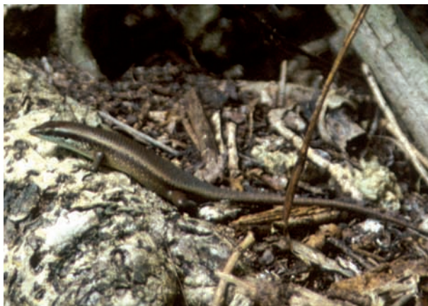
Fig. 11. Eutropis m. multicarinata from Salibabu Island.

Additional material: ZMA 18454 (1 spec.), Beo, Karakelong, coll. M. WEBER 1899.