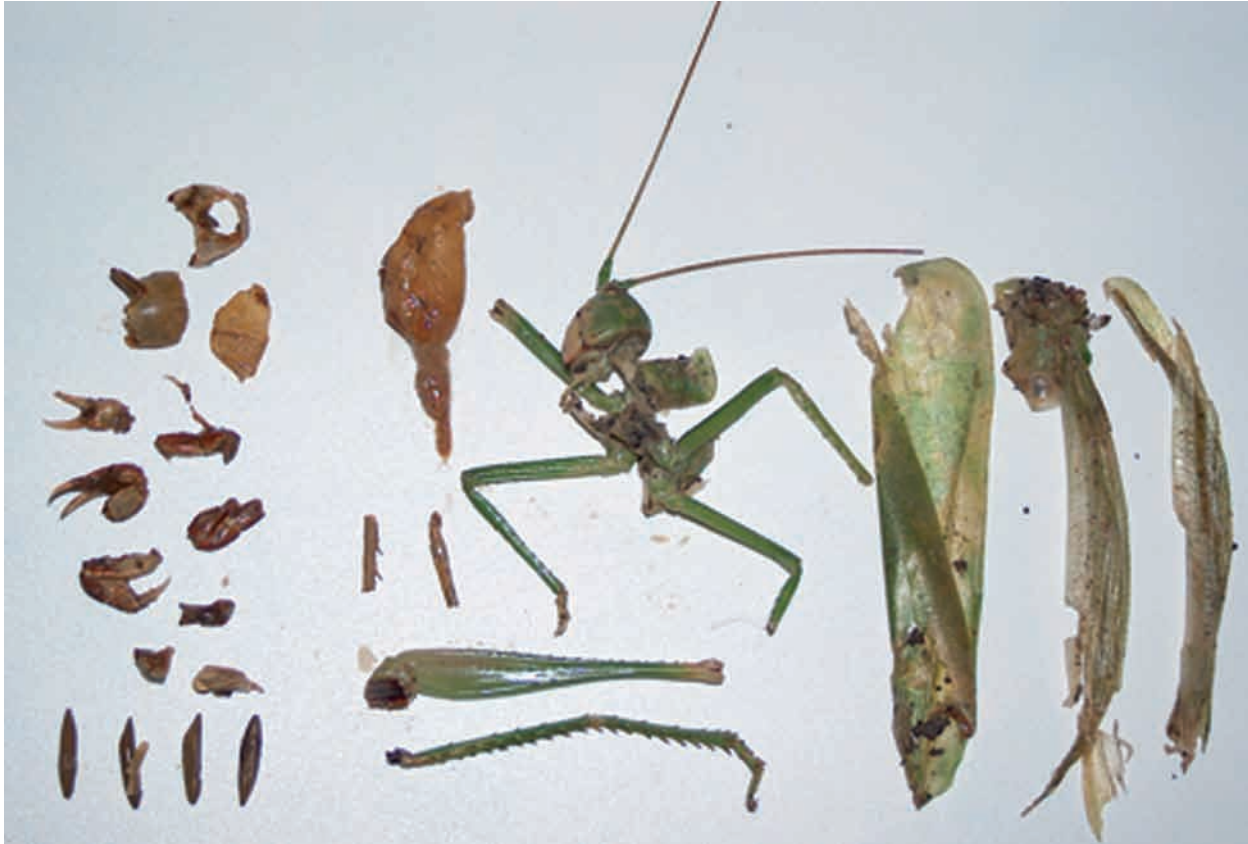
Fig. 15. Defecated prey remains from specimen MZB Lac. 5178 of Varanus sp. representing a large orthopteran ( Sexava sp., Tettigoniidae) and fragments of a crab.

tion of different age groups in the Talaud monitor lizards. While juvenile specimens seem to hide in thicket on the ground, adults obviously prefer a semi-arboreal life. The avoidance behaviour of juveniles seems reasonable because cannibalism is common in many monitor lizard species.