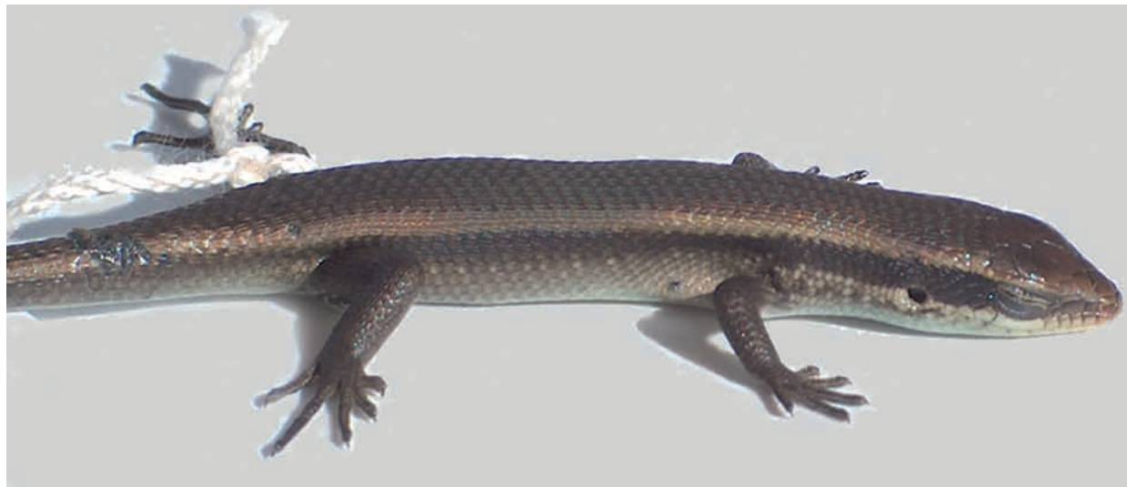
Fig. 12. Eutropis cf. rudis from Salibabu Island.

& ALCALA (1980) in having 20 and 22 keeled lamellae under fourth toe, 32 and 30 midbody scale rows (usually 28–30, rarely 31 or 32; 28–31 in E. rudis from Sulawesi according to HOWARD et al. [2007]), respectively. A postnasal is present. The hind limbs of MZB Lac. 5142 reach the axilla as postulated by DE ROOIJ (1915), while MZB Lac. 5113 exhibits tricarinate dorsals as typical for E. rudis . The second specimen's dorsal scales have up to five keels (very rarely in E. rudis according to BROWN & ALCALA [1980]), of which the three medians are strongly pronounced and flanked by two feeble outer keels. The Talaud specimens share this character with the newly described E. grandis from Sulawesi (HOWARD et al. 2007), from which, however, they are clearly distinguishable by higher midbody scale counts (30–32 vs. 25–27 in E. grandis ). In contrast to BROWN & ALCALA (1980) and HOWARD et al. (2007) both vouchers have 40 paravertebral rows (vs. 34–38 in Philippine E. rudis and 34–35 in Sulawesian E. rudis , respectively) between parietals and base of tail. The dorsal side is brown, laterally with a dark brown streak starting behind the nostrils, bordered above by a light brown streak; ventral side light grey, supralabials also grayish. In specimen MZB Lac. 5113 the ventral side is light gray only on the first half of the body; the rest including hind limbs and tail is brownish.