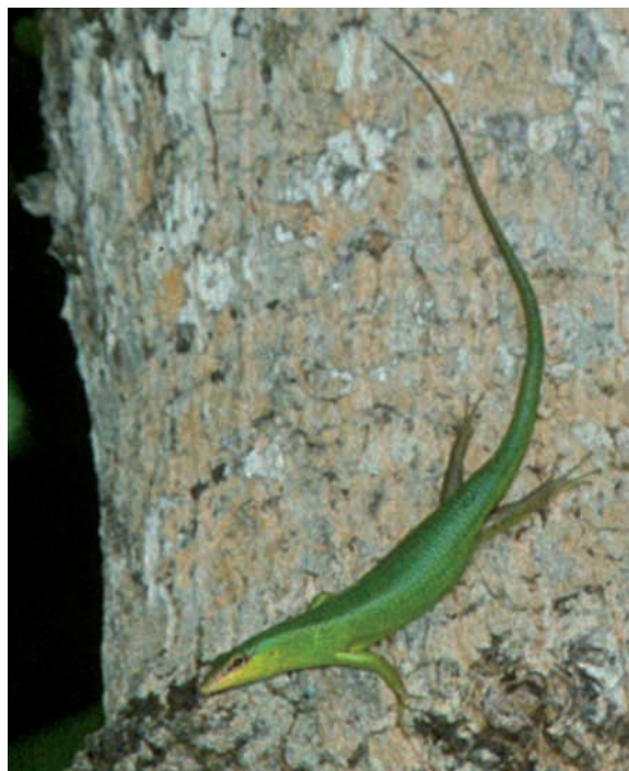
Fig. 13. Lamprolepis smaragdina ssp. from Salibabu Island.

Additional material: ZMA 11304 (1 spec.), Karakelang (= Karakelong), coll. H. J. LAM 1926; ZMA 18231 (1 spec.), Liroeng (= Lirung), Salibabu, coll. H. J. LAM 1926.