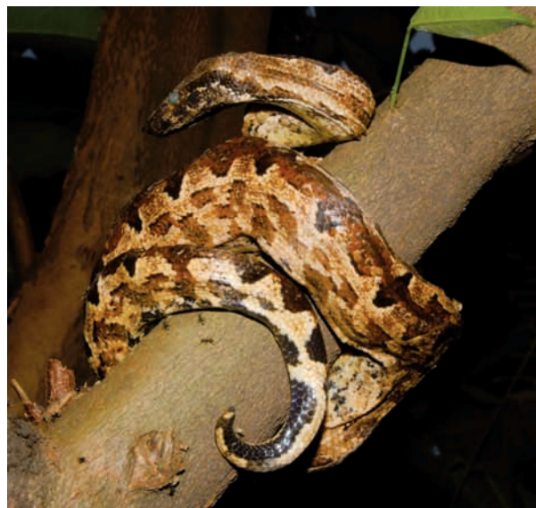
Fig. 16. Candoia paulsoni tasmai (MZB Serp. 2950) from Karakelong Island.