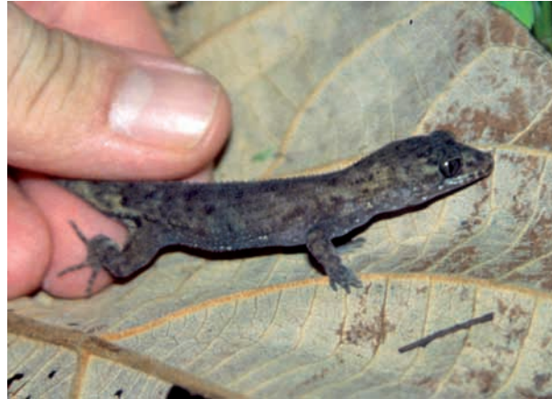
Fig. 9. Nactus cf. pelagicus from Salibabu Island.

Morphology: SVL 54 mm; tail regenerated, 55 mm long, fifth toe of left hind limb missing; probably a female, pre-anal pores missing; dorsum, limbs and tail (except for regenerated part) covered with granules and conical tuber-