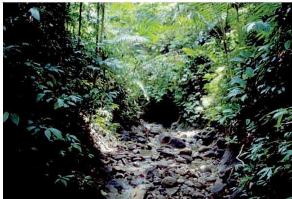
Fig. 4. Undisturbed riverine habitat upcountry of Salibabu Island. Habitat of Limnonectes sp. and an unidentified snake species.

forested. Surveys were done throughout all hours of day and early night. Specimens were mainly collected manually and with the assistance of a local villager. Voucher specimens were photographed prior to and after euthanization and preserved in 70 % ethanol. They are deposited in the Zoological Museum in Bogor (MZB). Tissue samples of monitor lizards were taken for molecular investigations and preserved in 95 % ethanol. Photographic vouchers are deposited in the private photo collections of AK and EA.