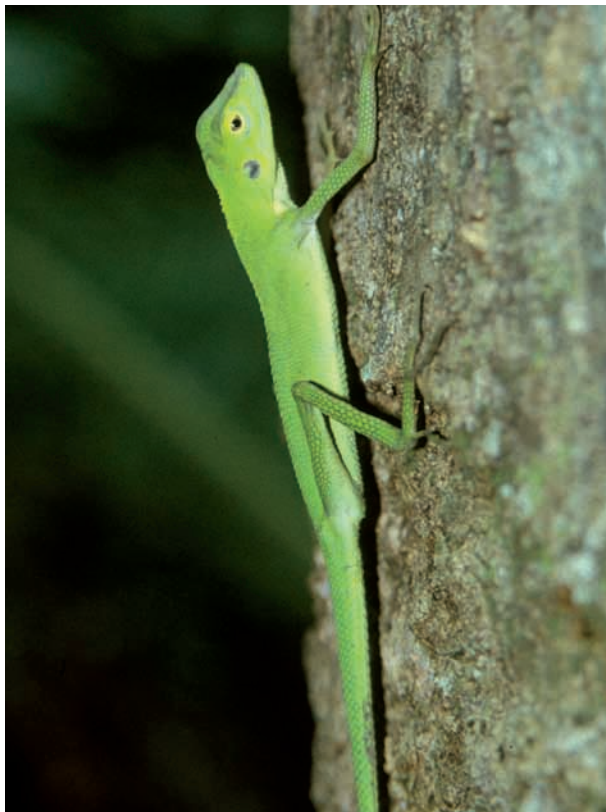
Fig. 7. Bronchocela cristatella from Salibabu Island.