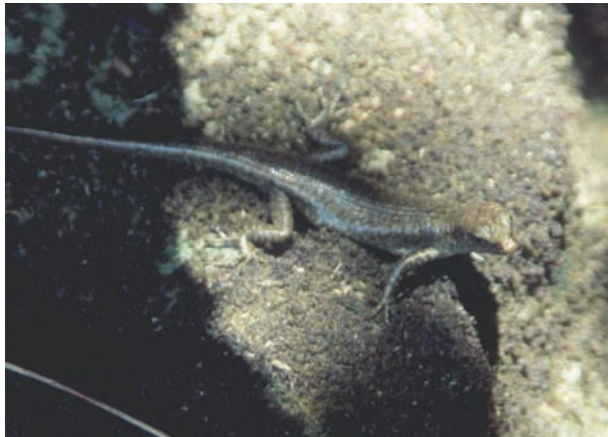
Fig. 10. Emoia a. atrocostata from Salibabu Island.

Distribution: According to BROWN (1991) the Talaud population of E. atrocostata belongs to the nominotypic subspecies. He examined one specimen from Karakelong (RMNH 18659). This coastal skink species is widespread ranging from the Philippines through the Indo-Australian Archipelago and many Pacific island groups such as the Carolines and Palau reaching North Australia. This is the first record of E. a. atrocostata for Salibabu Island.