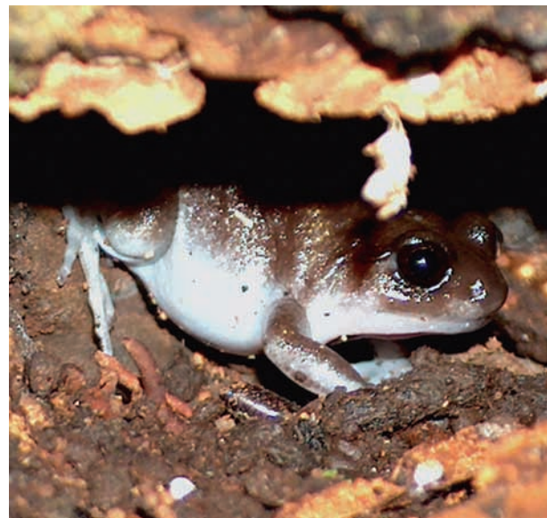
Fig. 6. Callulops cf. dubius from Salibabu Island.

Morphology & Taxonomy: Characteristically short-snouted, small frogs with short limbs: SVL 23.0–39.6 mm, TiL 9.5–15.5 mm; dorsally uniform dark brown to gray-