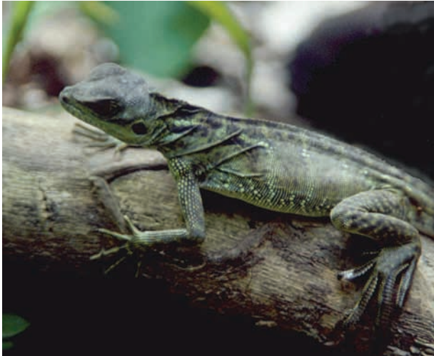
Fig. 8. Hydrosaurus sp. from Salibabu Island.

with six groups of two to six tubercular, carinate scales; three further such enlarged scales along the side of the neck; towards the ventral side numerous enlarged, smooth scales arranged in more or less distinct transverse rows; ventral scales homogenous, smooth; subdigitals under fourth toe small at basis, followed by 35 relatively enlarged subdigitals after first phalanx; toes laterally with a row of extremely wide (up to 1.9 mm) scales, 36 at fourth toe forming a serrated edge. Ten and eleven femoral pores, respectively. Ground color green to brownish with enlarged scales of the dorsal and lateral side being lighter; ventral side whitish, throat darker.