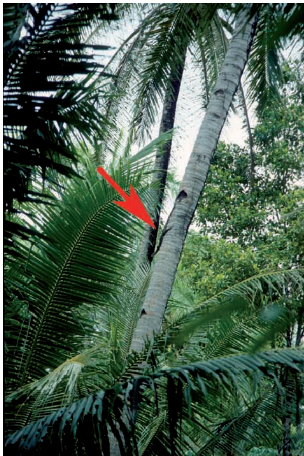
Fig. 3. Coconut and nutmeg plantations dominate the cultivated coastal landscape of Salibabu Island. Red arrow indicates Varanus sp. basking on a palm trunk.

Field studies on the east coast of Salibabu Island (ca. 95 km 2 ) were conducted by AK and EA from 13 to 21 July 2005. Collections and observations were made in the vicinity of Lirung, a settlement with a ferry landing stage. Field numbers are AK039 to AK075. The surroundings near the coastline are dominated by agricultural vegetation, especially coconut ( Cocos nucifera ) and nutmeg ( Myristica fragrans ) plantations (Fig. 3). The island's hilly interior was not intensively surveyed. In the low central hills, however, primary habitats or at least areas of minor disturbance still exist (Fig. 4). As recently recognized by RILEY (2002), and unlike the neighboring island Salibabu, large areas of Karakelong Island (ca. 970 km 2 ) are still