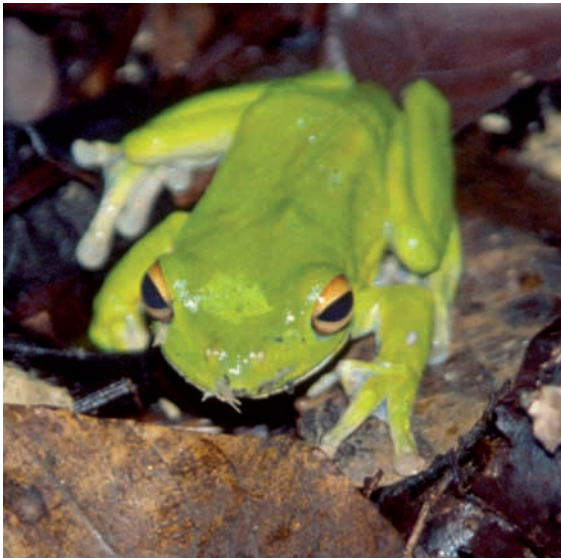
Fig. 5. Litoria infrafnata from Salibabu Island.

Additional material: MCZ A-24288, Karakelong, coll. FAIRCHILD Garden Expedition 1940; ZMA 8570 (3 spec.), Lirung, Salibabu, coll. M. WEBER 1899; ZMA 8576 (1 spec.), Beo, Karakelong, coll. M. WEBER 1899.