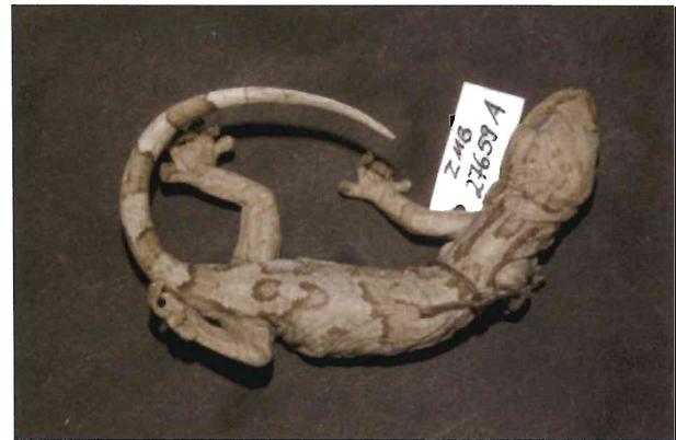
Fig. 13: Dorsal view of the lectotype of Gekko melli (ZMB 27659 A).

G. tawaensis reaches a SVL up to 70 mm and has internasals. The toes are basally narrowly webbed, and there are 12 subdigital lamellae under the 4th toe. The males have no preanofemoral pores, and the subcaudals are anteriorly mesially divided (OKADA 1956; SENGOKU 1989; UTSUNOMIYA et al. 1996).