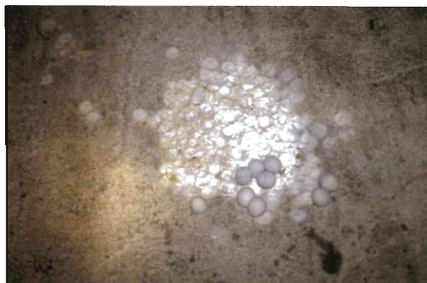
Fig. 10: Mass egg-laying site of Gekko scientiadventura sp. n. in a karst rock crevice at the type locality. Phot. T. ZIEGLER

On August 30, 2003, we measured at the lower egg-laying site, at 14.30 h, a relative humidity of 85% and a temperature of 27.3 °C. At 21.40 h the same day the temperature was 26.3 °C and the relative humidity had