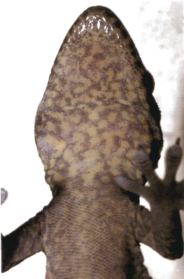
Fig. 6: Gular region of the male of Gekko scientiadventura sp. n. depicted in Fig. 5 (10 November 2003).