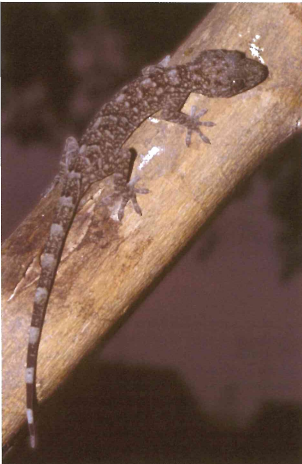
Fig. 4: Live female paratype of Gekko scientiadventura sp. n. (ZFMK 76174).