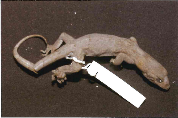
Fig. 11: Dorsal view of the holotype of Gekko subpalmatus (BMNH 1946.8.2592).