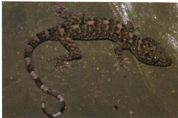
Fig. 1: Live holotype of Gekko scientiadventura sp. n. (ZFMK 76198).

Quang Binh Province, Vietnam, coll. H.-W. HERRMANN, VU NGOC THAN & T. ZIEGLER, 27-29 August 2001.