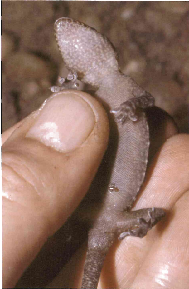
Fig. 2: Ventral view of the live holotype of Gekko scientiadventura sp. n. (ZFMK 76198).

2-3-2-2 ...) where scales each are bordering the respective broader subcaudal plate.