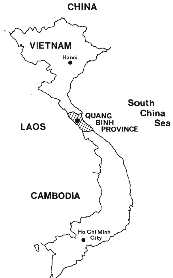
Fig. 8: Position of the type locality within Quang Binh Province.

So far, Gekko scientiadventura sp. n. is known only from the type locality (Fig. 8). Although currently regarded as endemic for Vietnam, its occurrence in Laos cannot be excluded, considering the proximity of the Laotian border from the type locality.