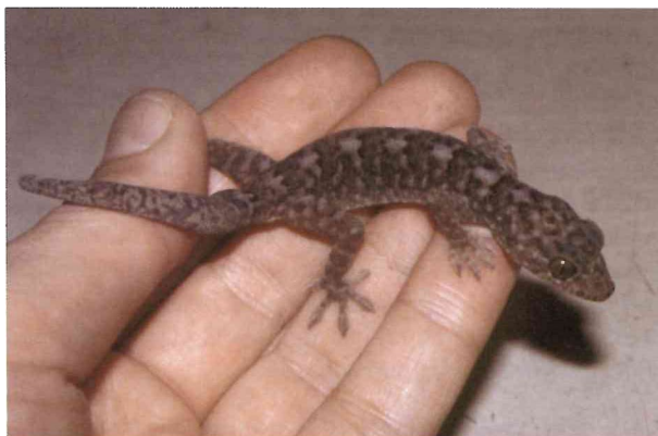
Fig. 7: Captive female of Gekko scientiadventura sp. n. (10 November 2003); note the regenerated tail.

3.1.8. Etymology. The species name is a patronym for a scientific magazine programme of the German Television channel ZDF called “Abenteuer Wissen” (adventure of knowledge) in order to acknowledge the first documentation of the Phong Nha - Ke Bang National Park biodiversity for the German public. First live pictures of Gekko scientiadventura sp. n. were shown on