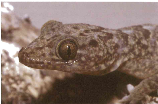
Fig. 5: Portrait of one of the captive males of Gekko scientiadventura sp. n. (see also fig. 28 in ZIEGLER et al. 2004) from 22 April 2003, measuring a SVL of 67 mm and a TL of 70 mm at the time; note the spiny posterior ciliaries as well as the bordering nasorostrals.

broad. The right postmental is divided in ZFMK 76176 and 76178. The posterior ciliaries are spiny in all paratypes. The remaining scalation characters vary to a small degree only (see Table 2). Range (mean and stan-