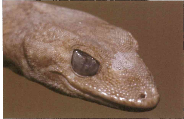
Fig. 12: Portrait of the holotype of Gekko subpalmatus (BMNH 1946.8.2592).