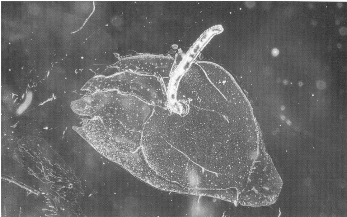
Fig. 4. The worm fragment lying in the field of putative coelomic fluid. Same view as in Fig. 1, higher magnification in darkfield illumination. Intact hind end of worm above, injured end below.

The worm fragment is c. 1400 \mu\text{m} long and 100–200 \mu\text{m} wide. It consists of 31 chaetigerous segments, considerably contracted towards the injured end. There are four chaetal bundles per segment, two lateral and two ventral ones. The dorsal half of the body surface is without chaetae. When viewed from the side with the best optical resolution (Fig. 5), the dorsal body surface is visible in the posterior half of the fragment. Only one lateral chaetal bundle per segment is visible here. Due to a successive torsion of the object, three chaetal bundles are discernible on the opposite side of the fragment, two ventral and one lateral.