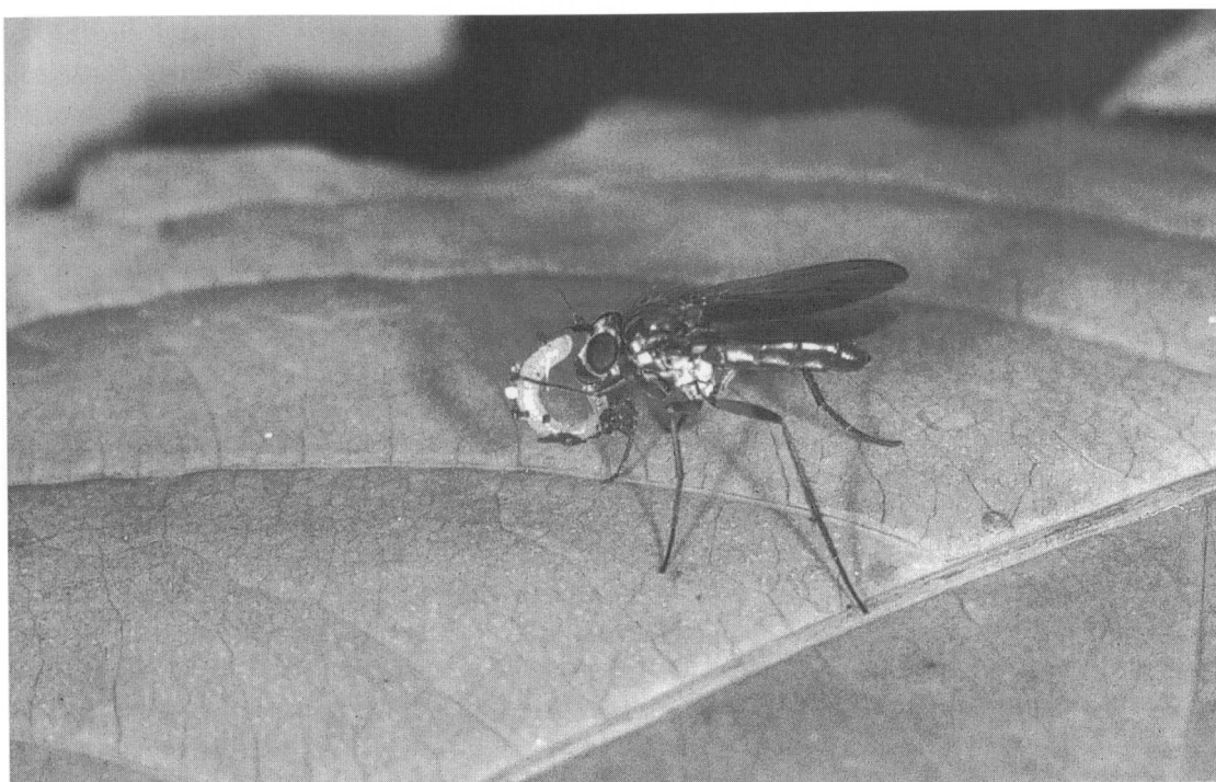
Fig. 3. Argyra auricollis ♀ with an enchytraeid. The fly is warding off the squirming worm with its left fore leg. Note the soil particles adhering to the worm. Upper Bavaria, Murnauer Moos, 23 July 1968.

to keep a squirming worm off its head (Fig. 3). Similar observations by Cregan (1941: 14) on Dolichopus ramifer Loew may be interpreted so. In other cases ( Hypophyllus obscurellus ) it seemed that the fly tried to press the worm against the soil with its legs during the struggle after capture.