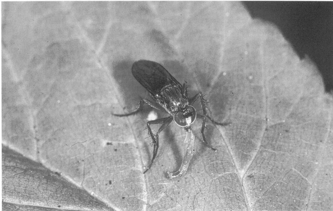
Fig. 2. Dolichopus unguulatus ♀ with an enchytraeid. The worm has been grasped at some distance from its end which is folded back. Swabian Jura, Härtsfeld, 10 July 1970.

(1828a: 15–16, 1828b: 227–228). The mouthparts of Dolichopodidae have been studied repeatedly. A classical account of their structure and function was published by Snodgrass (1922), extensive comparative descriptions by Cregan (1941) and Satô (1991).