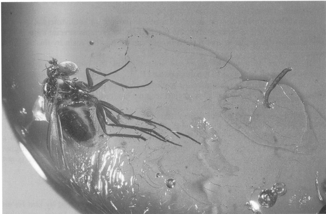
Fig. 1. The dolichopodid fly, Gheynia bifurcata ♀, and the enchytraeid worm (right) lying in the amber piece.

The position of both inclusions on the same plane proves that both were trapped at the same time or, at least, in the short time between two resin flows.