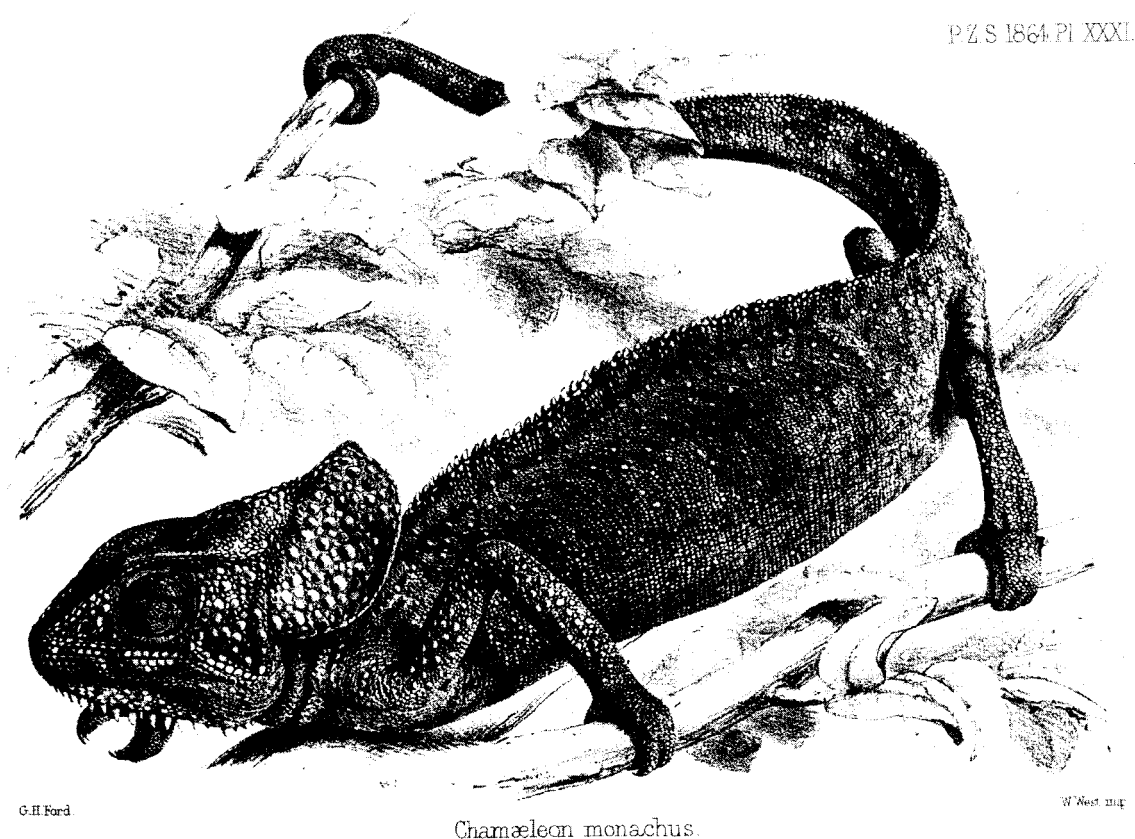
Fig. 2. Holotype (BM 1946.8.21.98) of Chamaeleo monachus Gray, 1865. Drawing from the original description: Gray 1865.