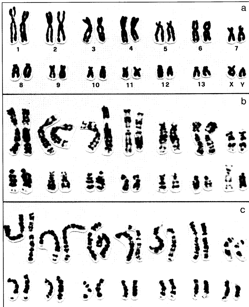
Fig. 1: Karyotype ( 2n=28 ) of C. leucodon from Lesbos (male, IZEA 3929) presented according to Grafodatsky et al. (1987); a) conventional staining; b, c) G-banding pattern.

dark on the back and very bright on the belly (Fig. 2a, 3). The feet are white. The tail is darker dorsally than ventrally, but not as bicoloured as in the continental form. The smaller shrews, with a condylo-basal length of less than 18 mm (Table 1), showed a karyotype of 2n=40 , typical of C. suaveolens . The colour is relatively uniform (Fig. 2b, 3).