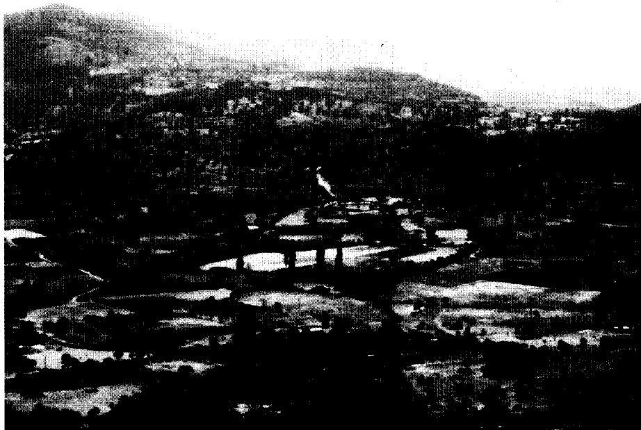
Fig. 4: The fertile agricultural landscape of Anemotia (Lesbos) in August.