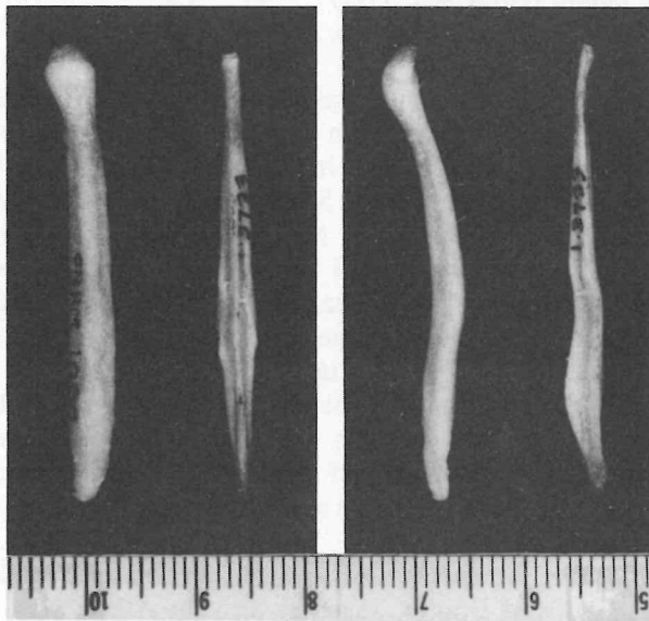
Plate 2: Dorsal (on left), lateral (on right) view of bacula. Left, in each pair: Vulpes cana ONHM. 1000, Jabal Samhan, Oman. Right, in each pair: Vulpes rueppelli HZM. 1.3733, 40 km west of Badanah, Saudi Arabia. Scale = mm & cm.

The skull of V. cana is notably small and delicate and although there is some overlap in size with V. rueppelli it is distinguishable from that species by the very delicate and relatively slender rostral region (Plate 1). The braincase is small and narrow anteriorly and the palate strikingly narrow. More material is clearly needed to clarify the cranial characters in relation to V. rueppelli and to study geographical variation in the region. The available external and cranial measurements, in mm., of the two V. cana (ONHM 1000 & ONHM 952) from Oman and an adult male (BM. 19.4.7.22) from Turbat, Baluchistan, included for comparative purposes, are given below in respective order: Total length 760, 735, —; tail 360, 350, —; forearm 60, 60, —; hind foot 101, 97, —; ear 80, 76, —; greatest length of skull 99.8, 97.7, 96.3; condylobasal length 96.4, 93.5, 91.3; zygomatic breadth 51.9, 51.0, —; breadth of braincase 36.8, 34.3, 35.1; interorbital constriction 17.5, 17.1, 17.4; maxillary cheekteeth C-M2 44.7, 42.8, 43.8; mandibular cheekteeth c-m3 47.7, 46.9, 48.3; mandible 74.9, 73.0, 71.2; rostral width above P1 14.0, 13.2, 13.5.