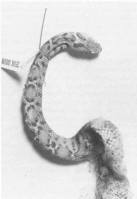
Fig. 1. Dorsal view of the holotype of Vipera wagneri sp. n. (ZFMK 32495). Total length 29.1 cm.

Diagnosis: A species of Vipera belonging to the V. xanthina species-group and thus lacking a complete circumocular ring and with the supraocular plates in broad contact with eye, no raised or angular supraocular plates, only one canthal on each side and having a well developed rhomboid (ocellated) dark dorsal pattern along the back on a lighter ground colour. The single female specimen at hand differs from V. xanthina in having more intercanthals, more first circumoculars, fewer subcaudals and only nine supralabials. It differs from V. bornmuelleri in having more ventrals, a single canthal on each side and fewer intersupraoculars. The dorsal pattern is similar to that found in some female V. xanthina and V. bornmuelleri .