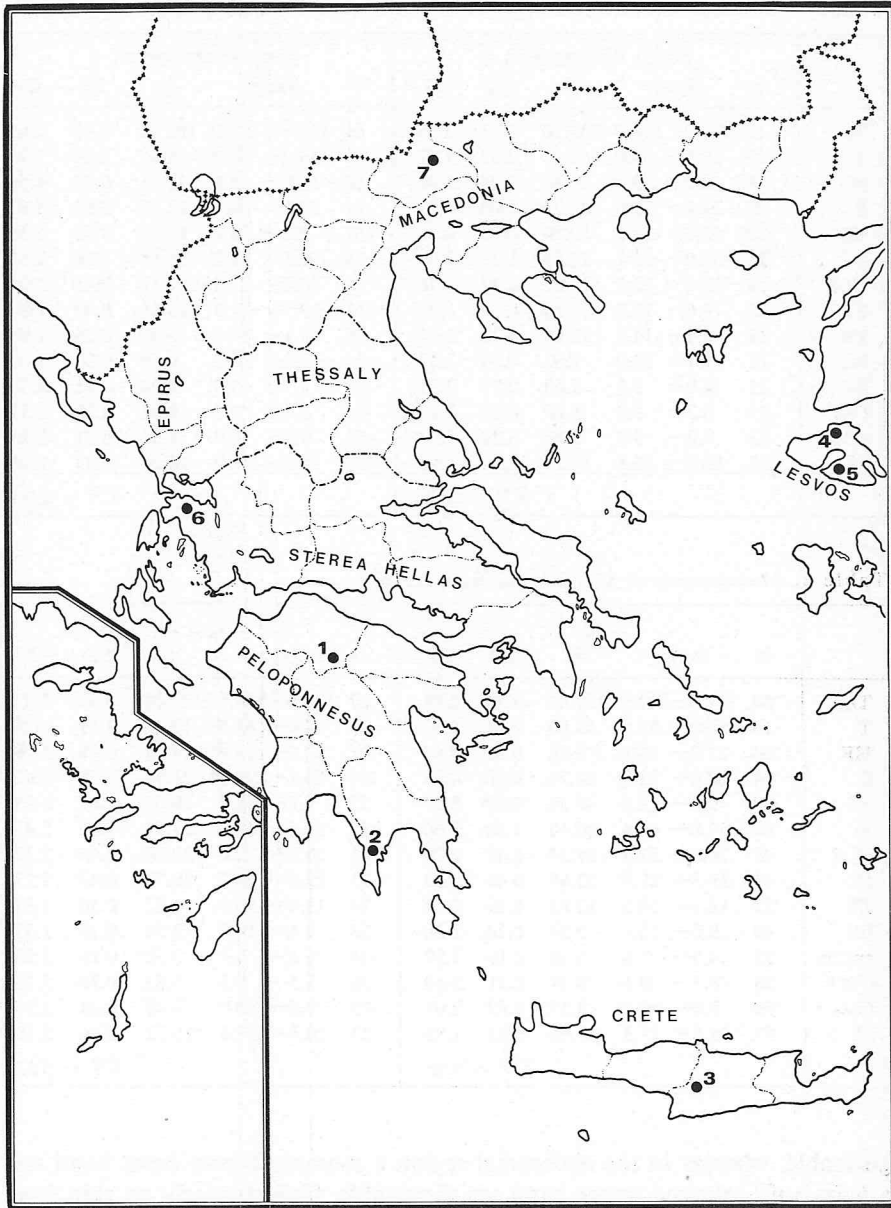
Fig. 1. Map of Greece showing the localities of the specimens of Myotis blythii studied in this paper. — 1, cave "Limnon", Achaia; 2, Flomochorion, Laconia; 3, cave "Micro Labyrinthaki", Eracleion; 4, Mithymna; 5, Polychnitos; 6, Monastiracion, Acarnania; 7, cave "Saranta Camares", Kilkis.