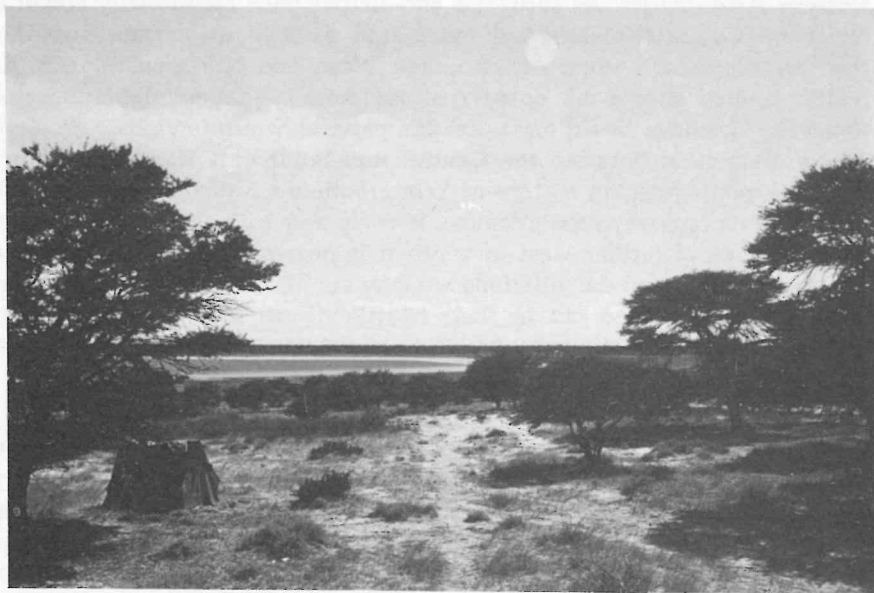
Fig. 5. Savanna bush between Tshane and Mabuasehube pan.