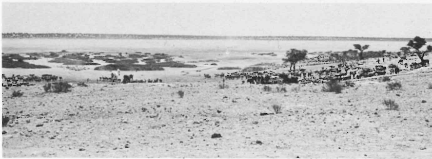
Fig. 2. Cattle and goat herds grazing at the shore of the dry Mabutsane pan.

As during the whole expedition I enjoyed the privilege of just sitting back in my seat while being driven around by my friends, I could fully concentrate on scenery and bird life and make notes, even while moving from camp to camp