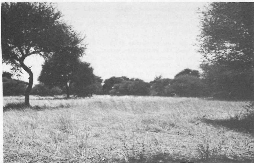
Fig. 4. Wooded savanna near the shore of the great Masetleng pan.