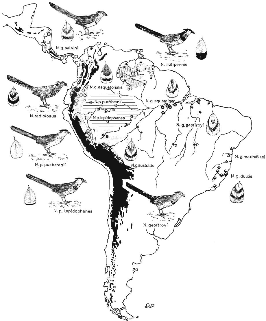
Fig. 1: Distribution of the Neomorphus geoffroyi species group.

Explanations: Neomorphus geoffroyi and N. radiolosus comprise the N. geoffroyi superspecies. Neomorphus rufipennis and N. pucheranii comprise the N. rufipennis superspecies. Symbols indicate collecting localities. Shaded areas — N. geoffroyi . Uniform gray shading — geoffroyi subspecies group: Closed stars — N. g. geoffroyi . Open stars — N. g. australis . Open stars in black circles — N. g. squamiger . Semiclosed triangles — N. g. maximiliani . Semiclosed squares — N. g. dulcis . Shaded by vertical hatching — salvini subspecies group: Open squares on edge — N. g. aequatorialis . Open squares — N. g. salvini . Area dashed horizontally and open triangles — N. radiolosus . Area stippled and closed circles — N. rufipennis . Area