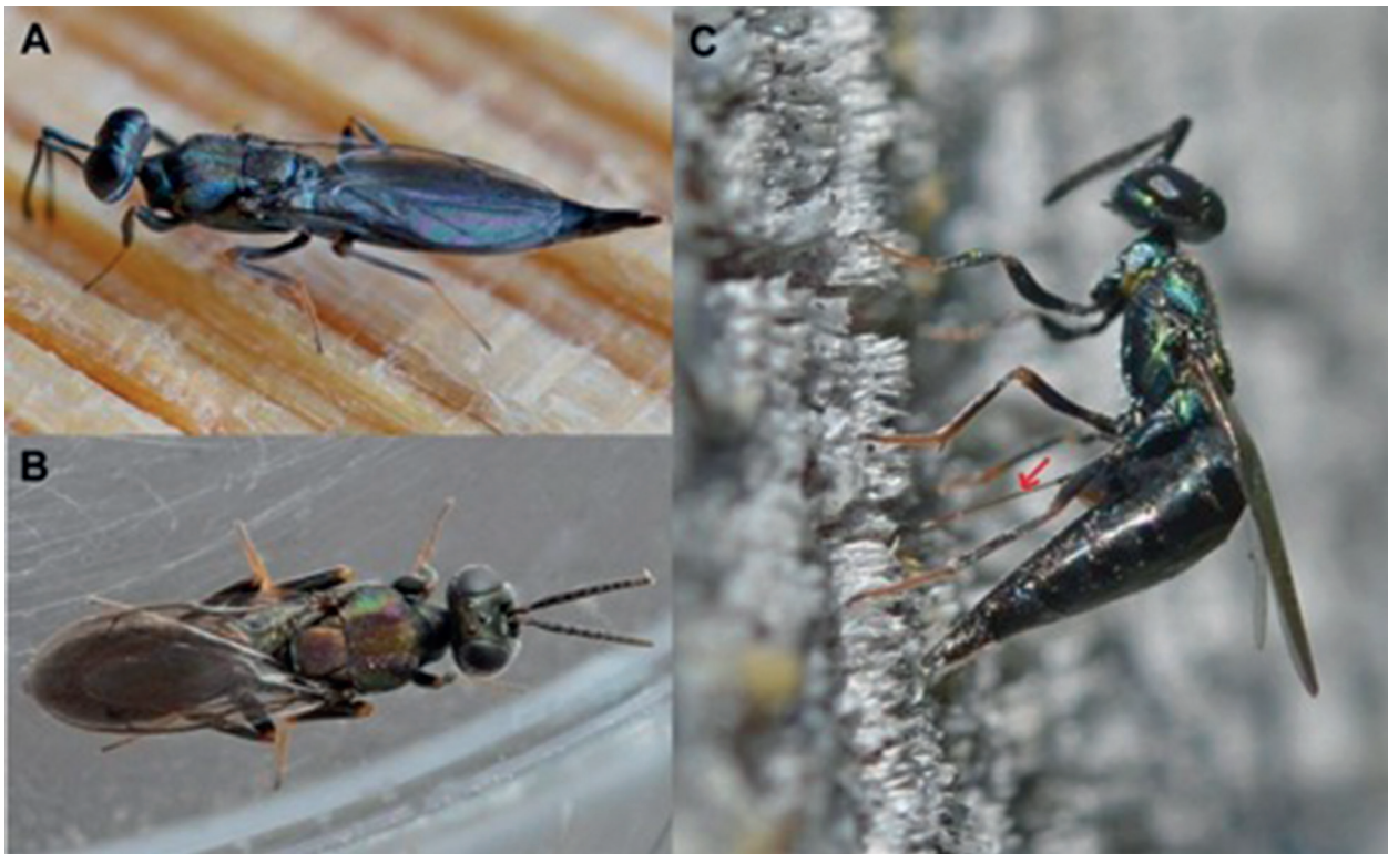
Fig 1. Calosota aestivalis (Eupelmidae: Calosotinae), a species newly recorded from Germany. A. female; B. male; C. female during oviposition. Live pictures are not from voucher specimen.

Next, we searched for species recorded from Germany with only one record or reference. Again, these single records were sorted according to their reference year.