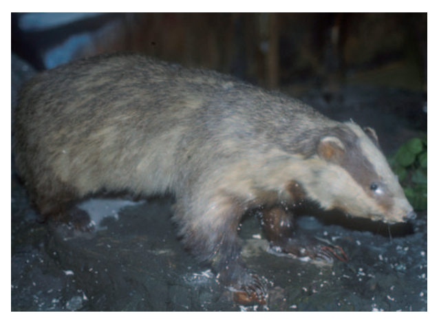
Fig. 2. Stuffed specimen of the badger Meles meles collected on the island of Santorini (Thera) in 1859, and part of the collection of the Zoological Museum of the University of Athens (ZMUA 128) (photo Anastasios Legakis; courtesy Zoological Museum of the University of Athens).

served that "Samos is infested with wolves". Anyway, this record should refer to jackals rather than wolves. There is in fact no evidence for the occurrence of the latter canides on the Greek islands of the late Holocene. According to Ioannidis & Giannatos (1991), the jackal no longer exists on Corfu, Kythera, Skyros and Ikaria, where it possibly became extinct in very recent historical times, but jackals vanished from Corfu not before 1991–1992 (Grémillet, in verbis). The only Aegean islands where the species still survives are Euboea (Demeter & Spassov 1993) and Samos (Laar & Daan 1967; Douma-Petridou 1977; Adamakopoulos et al. 1991; Ioannidis & Giannatos 1991; Demeter & Spassov 1993; Ioannidis et al. 1996; Dimitropoulos et al. 1998).