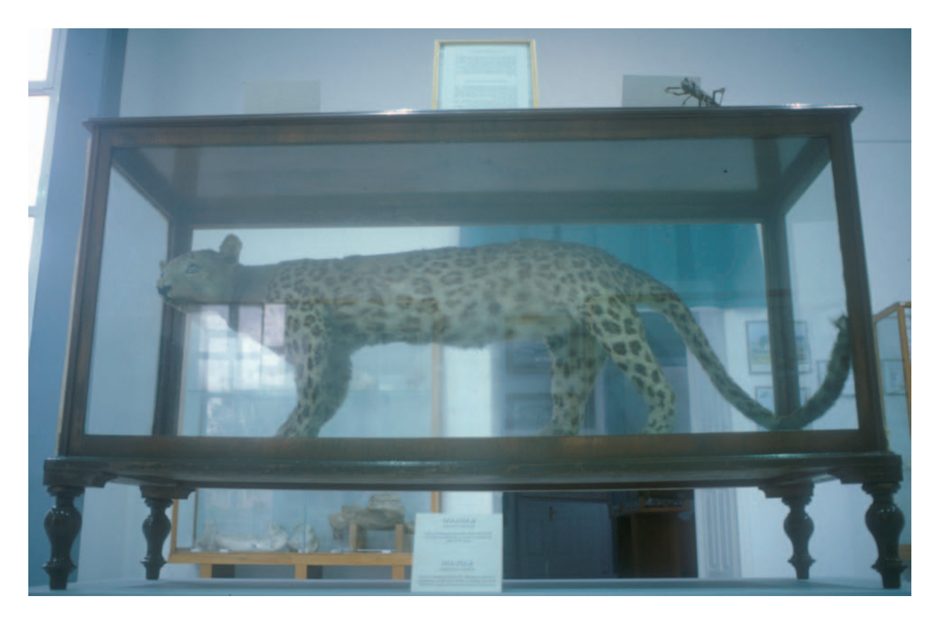
Fig. 4. The stuffed specimen of Asia Minor leopard, Panthera pardus tulliana Valenciennes, 1856, shown at the Natural History Museum of the Aegean, Samos (Greece).

ground tint. The coat is fairly short and full, the hair on the nape is long, and the tail is decidedly bushy. According to the colouration and coat pattern, this specimen could belong to the Anatolian leopard Panthera pardus tulliana, as mentioned by Valenciennes (1856), Pocock (1930) and Leyhausen (1991), and clearly distinct from other Near Eastern subspecies (Masseti 2000). It has also been said that the animal arrived at Samos from the opposite coast of Turkey, swimming across the channel separating the island from western Anatolia. In fact there is a deeply-rooted traditional belief on Samos which refer to leopards swimming from Anatolia in various periods. This was reported by Tournefort (1717) who confirmed this legend, observing that: ""Il y passe quelques tigres qui viennent de terre ferme par le Petit Boghas". Petit Boghas was the name used at this time to indicate the above mentioned channel. Clarke (1801) followed this observation and mentioned that: "tigers sometimes arrive from the mainland, after crossing the little Boccaze; thereby confirming all observation made by the author in the former section, with regard to the existence of triggers in Asia Minor". However, Tournefort (1717) report was probably not based on an own observation, but rather