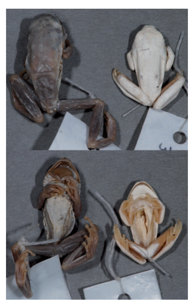
Fig. 2. Dorsal and ventral views of the types of left: Hyper-olius nitidulus (ZMB 7729, holotype, adult female) and right: H. spatzi (ZMB 32602, lectotype, subadult male).