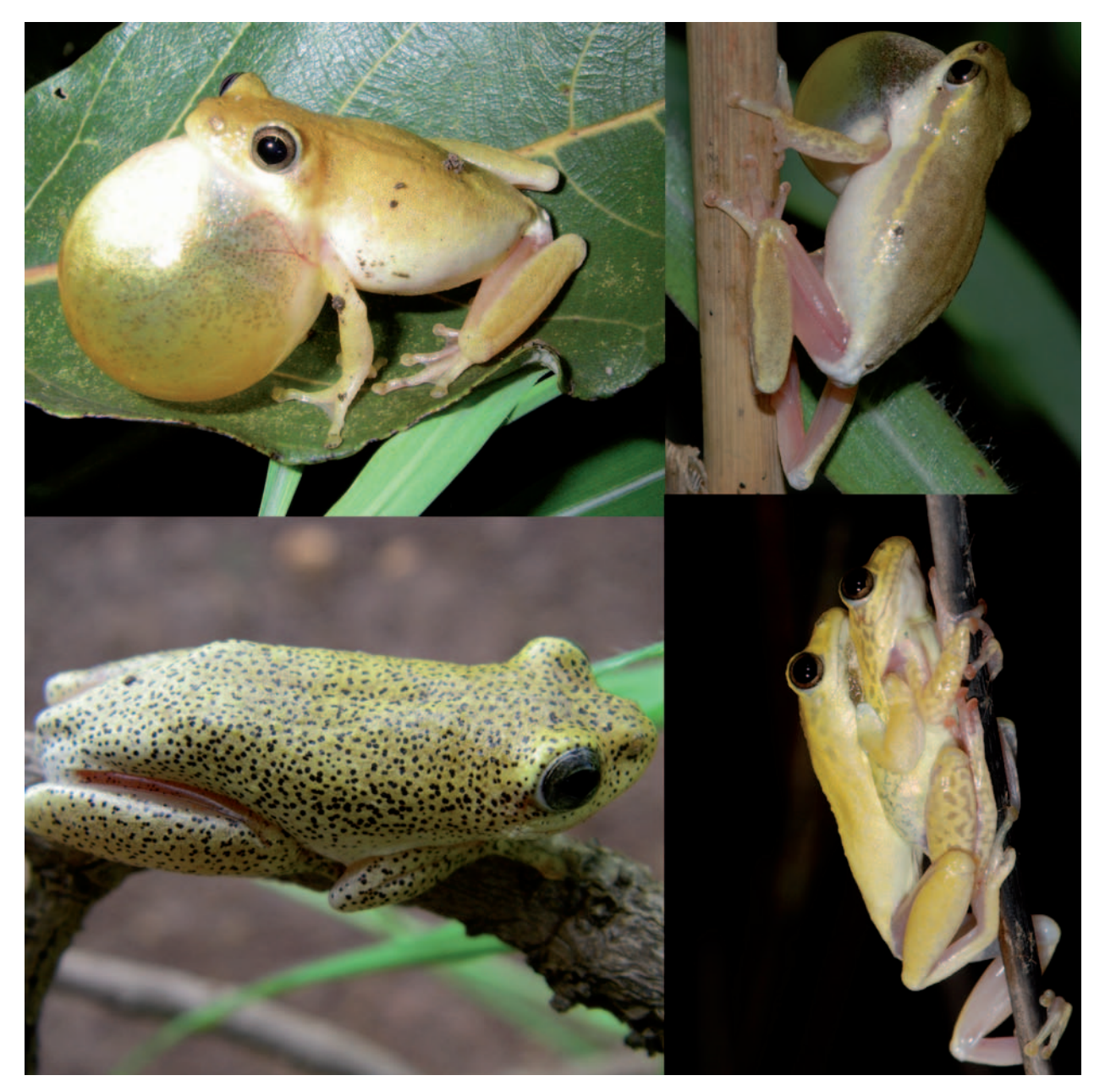
Fig. 1. Life coloration of Hyperolius spatzi and H. nitidulus ; upper left: calling H. spatzi male from Sabodala, Senegal, remark uniform yellow color at night; lower left: daytime coloration of H. spatzi from Sabodala, Senegal, with numerous minute black points; upper right: calling H. nitidulus male from Pendjari National Park, northern Benin, remark dark lateral band; lower right: H. nitidulus couple from Lamto reserve, Ivory Coast, remark almost uniform yellow color of male and grey mottling on legs and on the flanks in the female.

H. nitidulus Peters, 1875, was acknowledged species status, a decision previously already applied for mostly pragmatic reasons by e.g. Schiøtz (1967), Drewes (1984) and Rödel (1996, 2000). This widespread West African savanna frog was described by Peters (1875) from "Yoruba (Lagos)", Nigeria. It was treated as a synonym of H. marmoratus by Boulenger (1882), as a synonym of H. picturatus by Loveridge (1955) and as synonym or subspecies