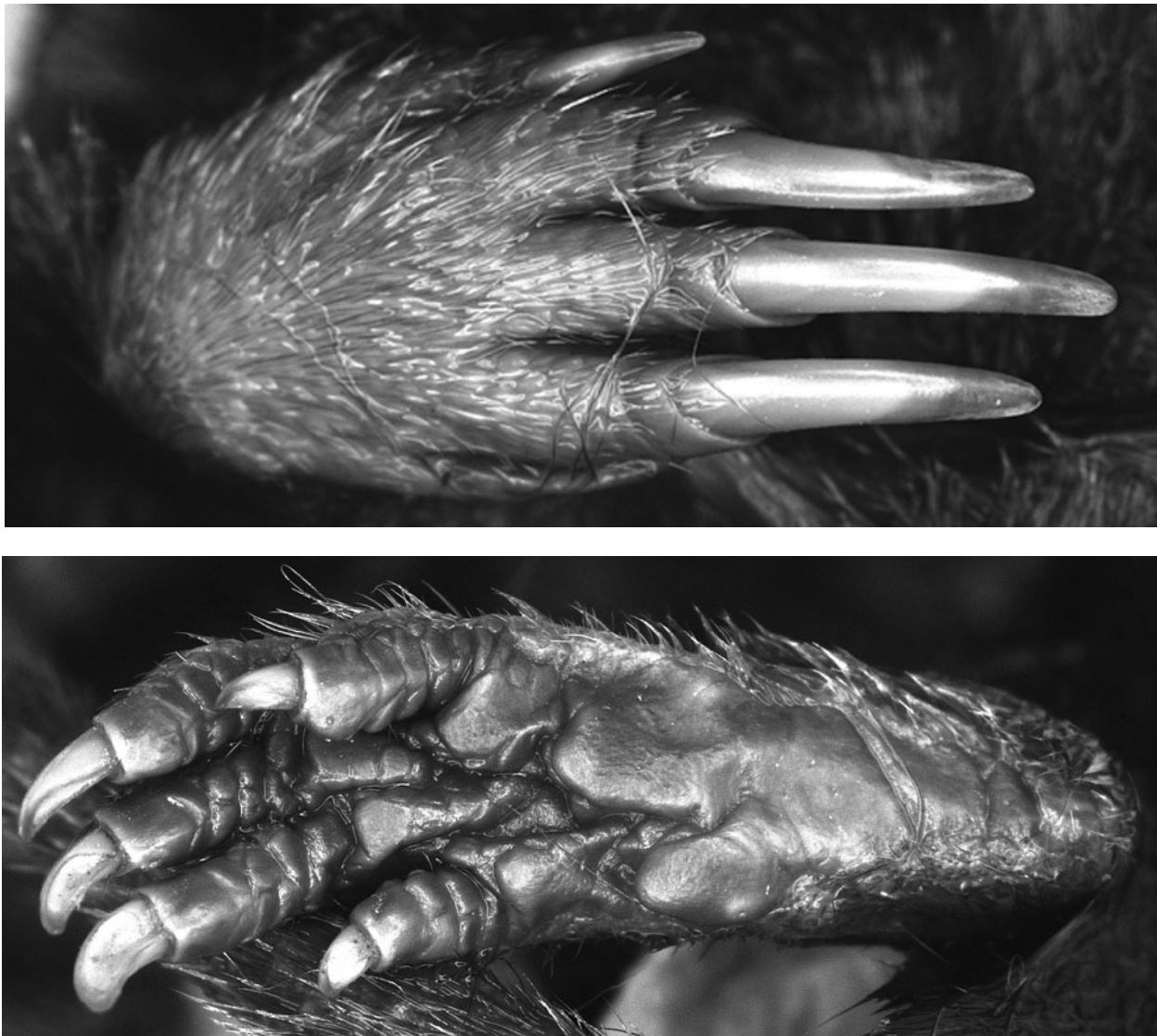
Fig. 2. Fore- and hindfoot of the holotype specimen of Surdisorex schlitteri n. sp. (FMNH 195069); length of hindfoot (including claws) is 16.1 mm.

Diagnosis. Intermediate in cranio-dental dimensions compared with the other two species in the genus, S. polulus and S. norae . Braincase smaller and absolutely shorter. The more anterior position of the pair of anterior palatal foramina is unique within the genus, as is the position of the last palatal foramen, situated between the second pair of unicuspid. Infraorbital bridge narrow. The lingual extension of the upper P 4 is longer than in the other