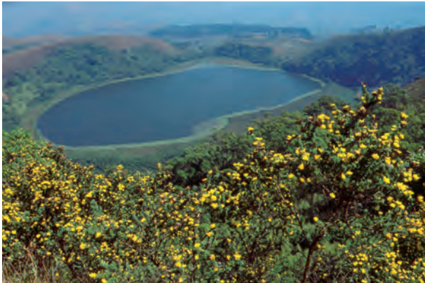
Fig. 4. Lower Bambili crater showing relict montane forest on the slopes and montane grassland along the shore of the lake. Photograph taken in 2001.

(W. BÖHME, field notes). The slopes of the lower Bambili crater are covered by a mosaic of montane forest, Lasiosiphon and bamboo woods and grassland. The slopes are partly rocky (Fig. 4). The surroundings of the craters are covered mainly by extensive pastures, Pteridium fern growth and open Lasiosiphon woods. It is not known where the owls picked up the shrews but the slope forest and the wet grassland bordering the lake may constitute suitable habitats.