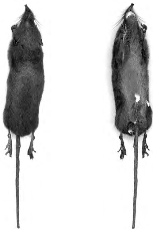
Fig. 1. Sylvisorex silvanorum n. sp., skin of holotype (ZFMK 74.430) in dorsal and ventral view. Total length is 99 mm.

Paratypes. Two incomplete skulls (ZFMK 2003.1103, 2003.1104) removed from pellets of Tyto capensis , collected November 2001 by J. Riegert and O. Sedláček on a slope of the lower Bambili volcano craters (5° 55' N, 10° 14' E, 2 400 m a.s.l.), about 8 km SE of the city of Bamenda, Bamenda Highlands, NW Province, Camty of Bamenda, Bamenda Highlands, NW Province, Cameroon (RIEGERT et al. 2008).