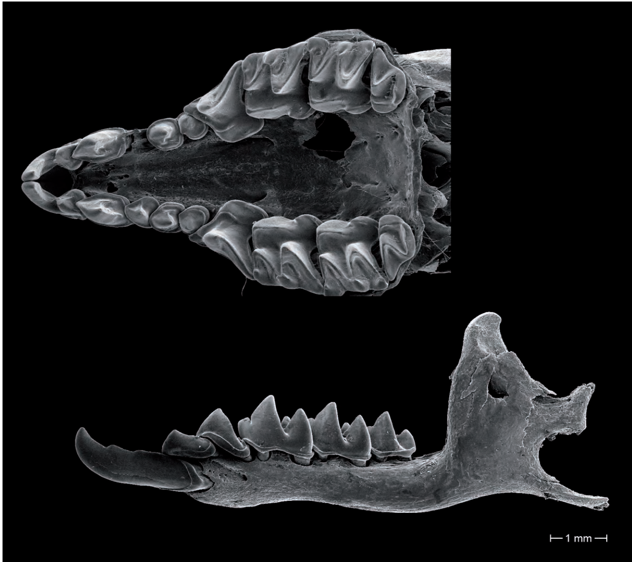
Fig. 2. Sylvisorex silvanorum n. sp., skull of holotype; cranium and upper dentition in occlusal view, and left mandible in labial view. Scale 1 mm.

Upper teeth: First upper incisor small, with a sharp anterior tip and a well-developed talon. First upper unicuspid large, second and third unicuspids half and fourth unicuspid a quarter of the length of the first unicuspid. P4 with a small parastyle and a large paracone; the protocone is well expressed. M1-2 square-shaped in occlusal view, protocone strongly developed. M3 relatively large (0.69 x 1.14 mm in the holotype).