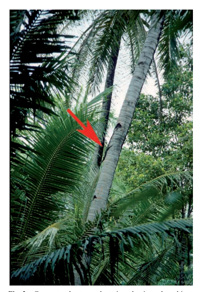
Fig. 3. Coconut and nutmeg plantations dominate the cultivated coastal landscape of Salibabu Island. Red arrow indicates Va ranus sp. basking on a palm trunk.

Field studies on the east coast of Salibabu Island (ca. 95 km<sup>2</sup>) were conducted by AK and EA from 13 to 21 July 2005. Collections and observations were made in the vicinity of Lirung, a settlement with a ferry landing stage. Field numbers are AK039 to AK075. The surroundings near the coastline are dominated by agricultural vegetation, especially coconut ( Cocos nucifera ) and nutmeg ( Myristica fragrans ) plantations (Fig. 3). The island's hilly interior was not intensively surveyed. In the low central hills, however, primary habitats or at least areas of minor disturbance still exist (Fig. 4). As recently recognized by RILEY (2002), and unlike the neighboring island Salibabu, large areas of Karakelong Island (ca. 970 km<sup>2</sup>) are still