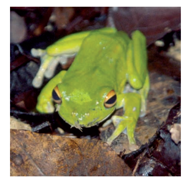
Fig. 5. Litoria infrafrenata from Salibabu Island.

Additional material : MCZ A-24288, Karakelong, coll. FAIRCHILD Garden Expedition 1940; ZMA 8570 (3 spec.), Lirung, Salibabu, coll. M. WEBER 1899; ZMA 8576 (1 spec.), Beo, Karakelong, coll. M. WEBER 1899.