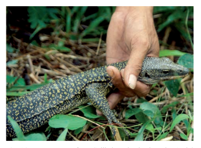
Fig. 14. Varanus sp. from Salibabu Island.

Material examined : MZB Lac. 5176 (AK067), MZB Lac. 5177 (AK064), MZB Lac. 5178 (AK059), MZB Lac. 5179 (AK066), MZB Lac. 5180 (AK065); MZB Lac. 581 (954),