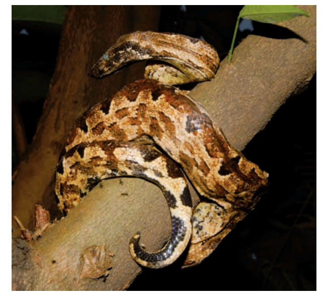
Fig. 16. Candoia paulsoni tasmai (MZB Serp. 2950) from Karakelong Island.