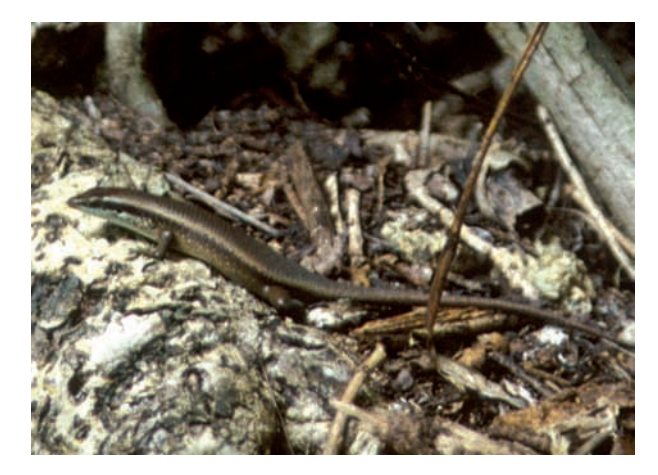
Fig. 11. Eutropis m. multicarinata from Salibabu Island.

Additional material: ZMA 18454 (1 spec.), Beo, Karakelong, coll. M. WEBER 1899.