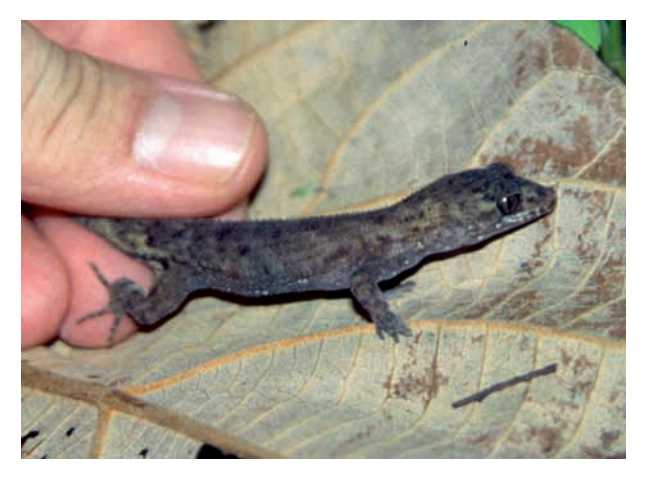
Fig. 9. Nactus cf. pelagicus from Salibabu Island.

Morphology: SVL 54 mm; tail regenerated, 55 mm long, fifth toe of left hind limb missing; probably a female, preanal pores missing; dorsum, limbs and tail (except for regenerated part) covered with granules and conical tuber-