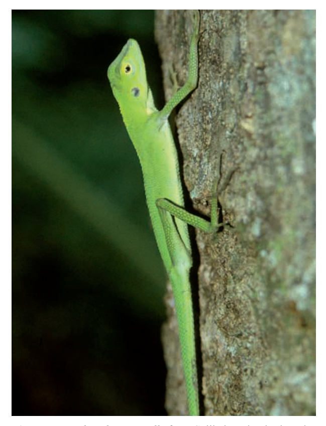
Fig. 7. Bronchocela cristatella from Salibabu Island.