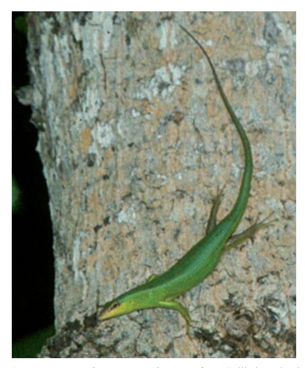
Fig. 13. Lamprolepis smaragdina ssp. from Salibabu Island.

Additional material: ZMA 11304 (1 spec.), Karakelang (= Karakelong), coll. H. J. LAM 1926; ZMA 18231 (1 spec.), Liroeng (= Lirung), Salibabu, coll. H. J. LAM 1926.