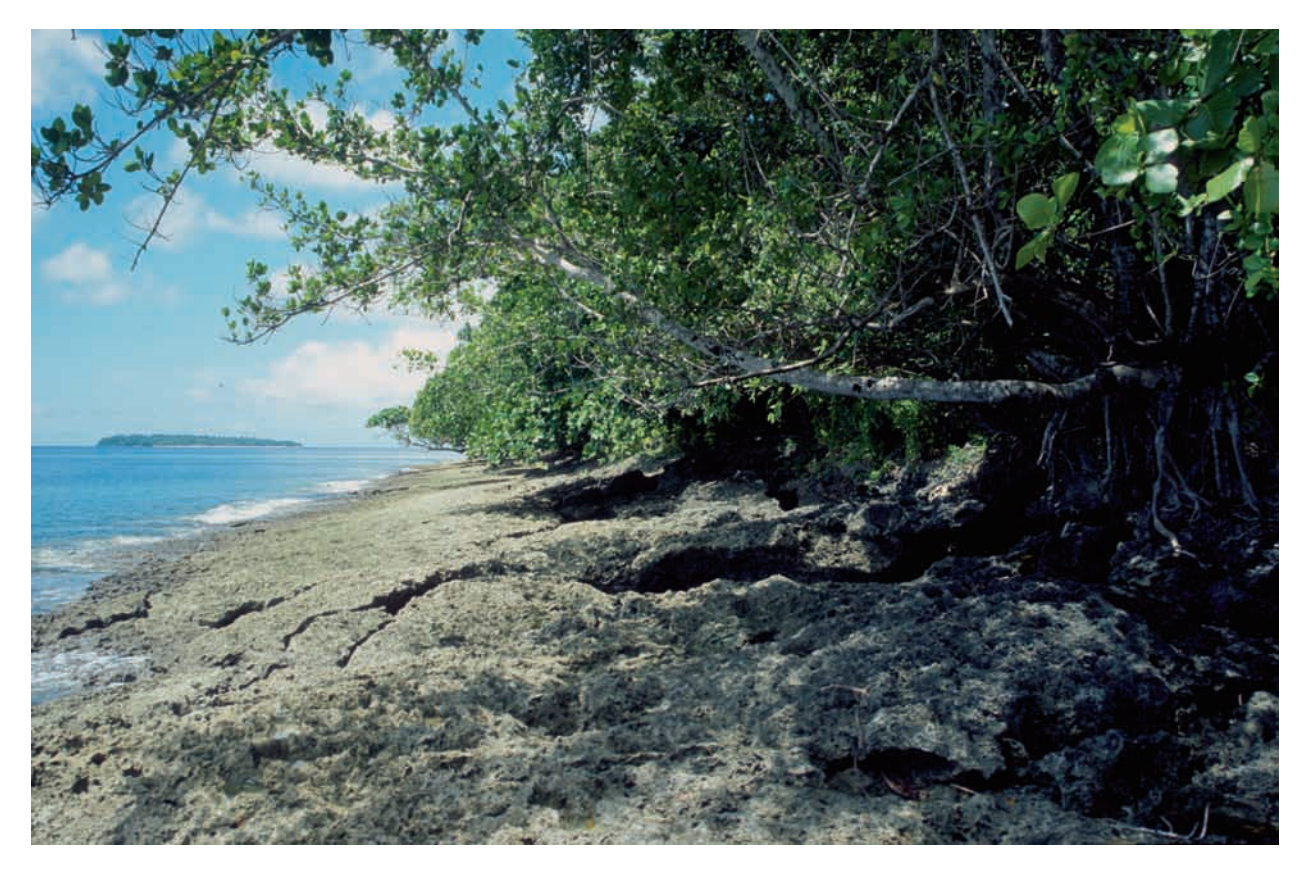
Fig. 2. Coast line with coral limestone deposits on Salibabu Island. Habitat of Varanus sp. and Emoia a. atrocostata.

The geographically isolated position between three biogeographic subregions in the centre of the Indo-Australian Archipelago render the Talaud Islands an interesting field of research for biogeographers. Until recently, however, the Talaud Archipelago (together with Sangihe) has been one of the least-known areas of the Sulawesi region as defined by VANE-WRIGHT (1991). Hence, due to their minor geographic size together with their remote location, the Talaud Island group has been paid only little attention by herpetologists in the past and scientific literature about the herpetofauna of this small archipelago is scarce. VAN KAMPEN (1907; 1923) and DE ROOIJ (1915; 1917) provided the first herpetological data about the Talaud Islands based on material collected by M. WEBER during the Siboga Expedition of 1899. DE ROOIJ (1915; 1917) listed five different lizards species (Calotes jubatus, Varanus indicus, Lygosoma cyanurum, Lygosoma rufescens, and Mabuia multicarinata) and one snake species (Candoia carinata). Later, DE JONG (1928) published the results of another small collection by the Dutch botanist H. J. LAM who visited Karakelong and Salibabu as well as Miangas, a small islet south of Mindanao, in 1926 (LAM 1926; 1942). His Talaud collection comprised ten different species representing eight lizards and two snakes. Voucher specimens by M. WEBER and H. J. LAM from the Ta-