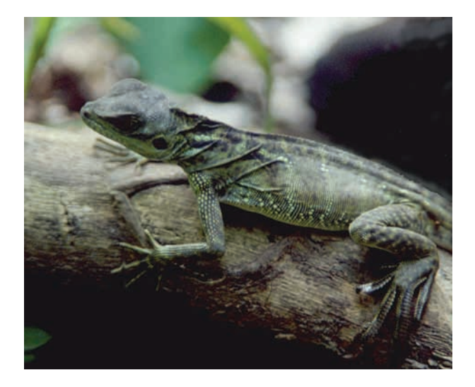
Fig. 8. Hydrosaurus sp. from Salibabu Island.

with six groups of two to six tubercular, carinate scales; three further such enlarged scales along the side of the neck; towards the ventral side numerous enlarged, smooth scales arranged in more or less distinct transverse rows; ventral scales homogenous, smooth; subdigitals under fourth toe small at basis, followed by 35 relatively enlarged subdigitals after first phalanx; toes laterally with a row of extremely wide (up to 1.9 mm) scales, 36 at fourth toe forming a serrated edge. Ten and eleven femoral pores, respectively. Ground color green to brownish with enlarged scales of the dorsal and lateral side being lighter; ventral side whitish, throat darker.