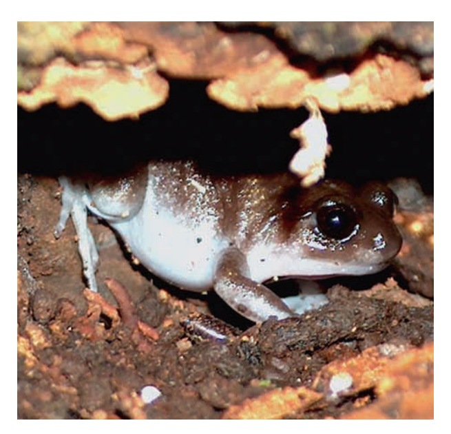
Fig. 6. Callulops cf. dubius from Salibabu Island.

Morphology & Taxonomy: Characteristically shortsnouted, small frogs with short limbs: SVL 23.0–39.6 mm, TiL 9.5–15.5 mm; dorsally uniform dark brown to gray-