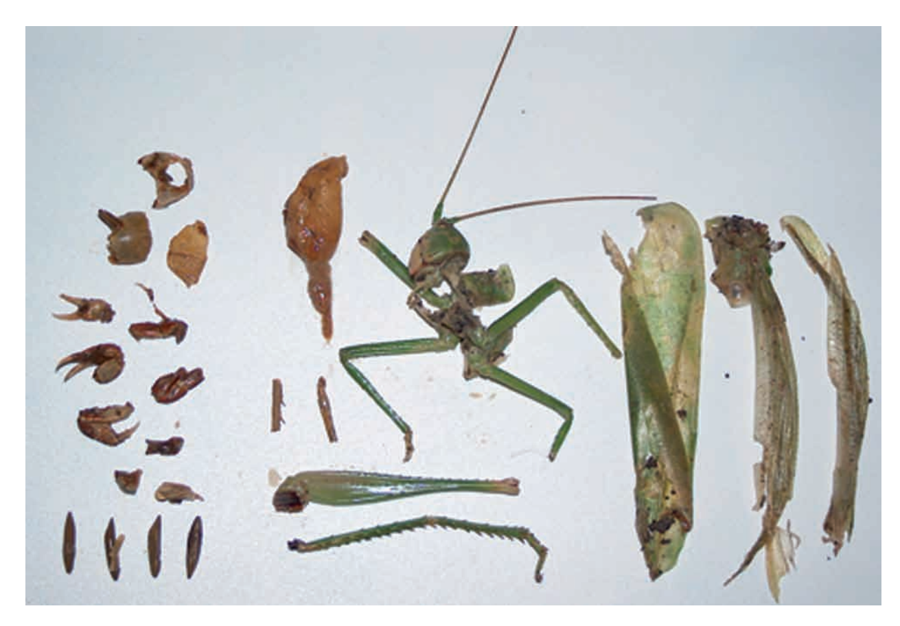
Fig. 15. Defecated prey remains from specimen MZB Lac. 5178 of Varanus sp. representing a large orthopteran ( Sexava sp., Tettigoniidae) and fragments of a crab.

tion of different age groups in the Talaud monitor lizards. While juvenile specimens seem to hide in thicket on the ground, adults obviously prefer a semi-arboreal life. The avoidance behaviour of juveniles seems reasonable because cannibalism is common in many monitor lizard species.