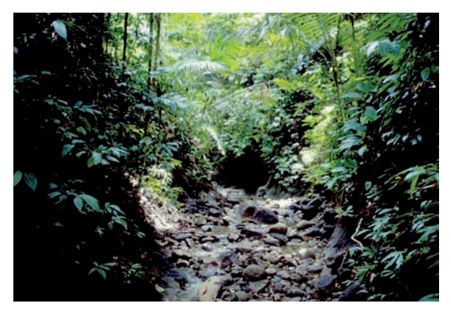
Fig. 4. Undisturbed riverine habitat upcountry of Salibabu Island. Habitat of Limnonectes sp. and an unidentified snake species.

forested. Surveys were done throughout all hours of day and early night. Specimens were mainly collected manually and with the assistance of a local villager. Voucher specimens were photographed prior to and after euthanization and preserved in 70 % ethanol. They are deposited in the Zoological Museum in Bogor (MZB). Tissue samples of monitor lizards were taken for molecular investigations and preserved in 95 % ethanol. Photographic vouchers are deposited in the private photo collections of AK and EA.