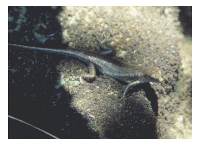
Fig. 10. Emoia a. atrocostata from Salibabu Island.

Distribution: According to BROWN (1991) the Talaud population of E. atrocostata belongs to the nominotypic subspecies. He examined one specimen from Karakelong (RMNH 18659). This coastal skink species is widespread ranging from the Philippines through the Indo-Australian Archipelago and many Pacific island groups such as the Carolines and Palau reaching North Australia. This is the first record of E. a. atrocostata for Salibabu Island.