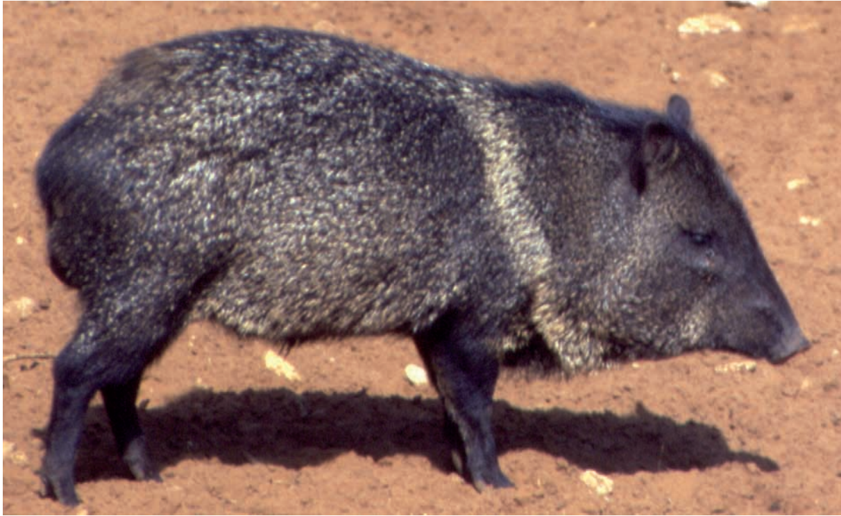
Fig. 5. Live Pecari tayacu , congener of P. maximus to show the different body proportions.