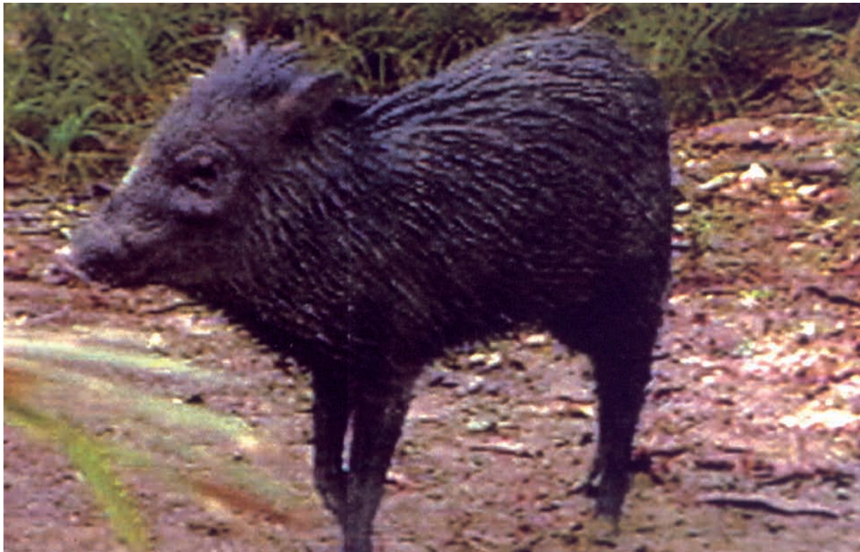
Fig. 4. Live Pecari maximus from the type locality.

trees Bertholletia excelsa . The upper canopy closes at the height of 30–40 m. The densest understory is associated with moist depressions along forest brooks.