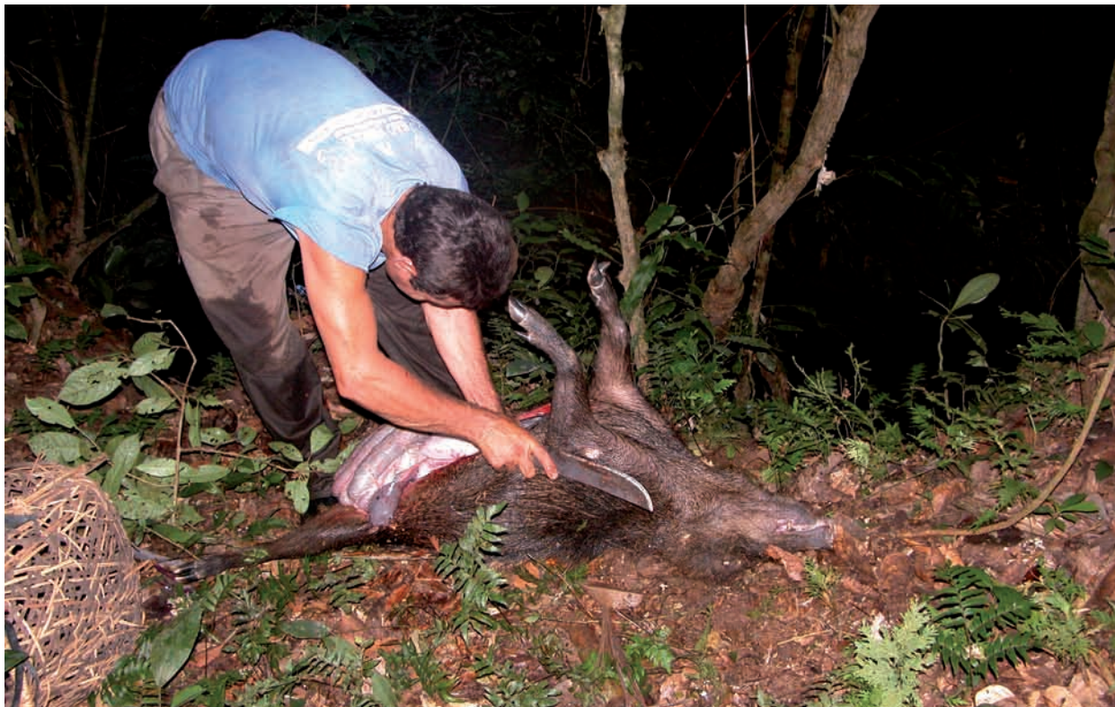
Fig. 3. Local hunter beginning to skin same specimen.

of the cheek area only). The brown dark mottled fur colouration differed from the strongly speckled dark blackish-grey fur colouration of P. tayacu as well as from the blackish brown longer fur of T. pecari . In the figures the differences in fur colour and bristle-haired texture are evident although the freshly killed female pig lay in a forest creek and was therefore wet.