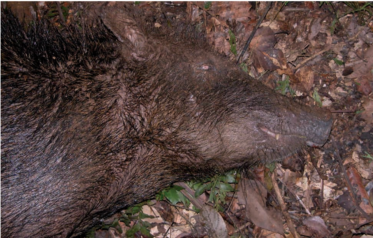
Fig. 2. Lateral view of the head of the same specimen.