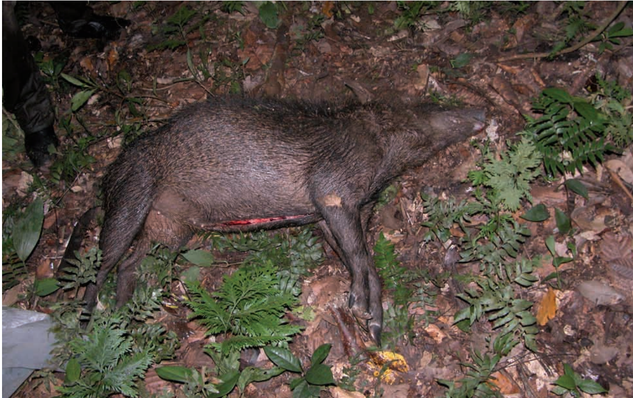
Fig. 1. Young female Pecari maximus , shot at Bioceánica, Bolivia.