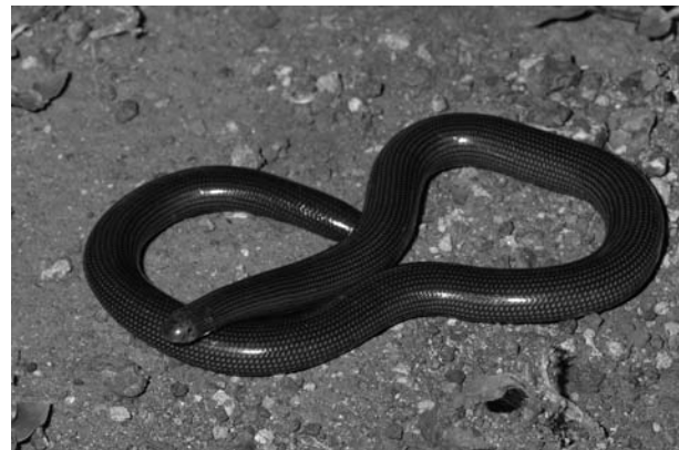
Fig. 18. Typhlops lineolatus from Kakamega Forest.

Remarks: This taxon is known only from literature (LOVERIDGE 1935) and further data were not available.