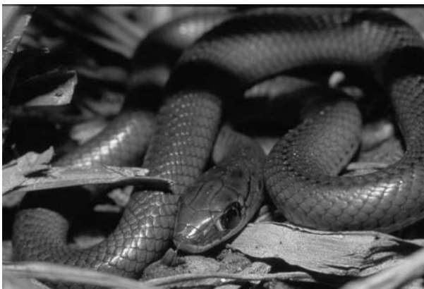
Fig. 21. Psammophis phillipsi from Kakamega Forest.

Remarks: These vouchers represent the first record of the species for Kenya. For the taxonomic assignment see P. mossambicus . SPAWLS et al. (2002) placed the eastern populations of P. phillipsi and P. sibilans in the synonymy of