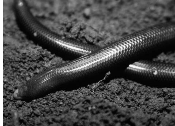
Fig. 15. Feylinia currori from Kakamega Forest.

leaf litter (NMK L/2662). A morphological comparison between east and west African populations results in no geographic directed differences (WAGNER & SCHMITZ 2006).