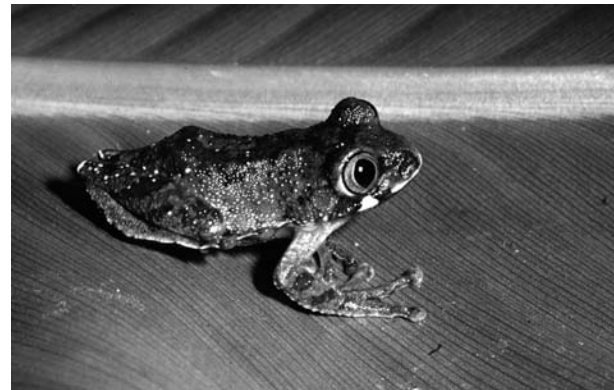
Fig. 7. Leptopelis mackayi from Kakamega Forest.

Remarks: All vouchers were from the Buyangu area and some were collected with a drift fence next to a pond. One specimen was collected on the Buyangu Hill outside the forest under stones.