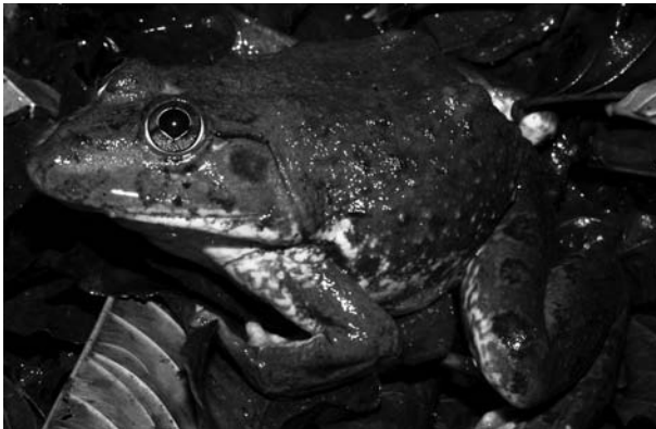
Fig. 2. Hoplobatrachus occipitalis from Kakamega town.

Remarks: The voucher was collected in a swamp in the Buyangu area. Specimens, both adults and tadpoles, were found in an old swimming pool of the Serena Island Lodge in Kakamega town and were documented by a voucher specimen (NMK uncatalogued) and photographs.