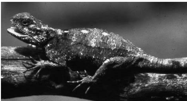
Fig. 9. Acanthocercus atricollis from Kakamega Forest.

Remarks: The debate of the taxonomic status of this species is still ongoing. Many authors (e. g. BOULENGER 1896, KLAUSEWITZ 1957, LOVERIDGE 1957) have discussed differences or similarities between this taxon and Acanthocercus cyanogaster RÜPPELL 1835. SPAWLS et al. (2002), LARGEN & SPAWLS (2006) and our own morphology studies of the two species support KLAUSEWITZ (1957) who regarded them as two distinct species. The reported distribution of both taxa is unclear because of the mentioned taxonomic problems.