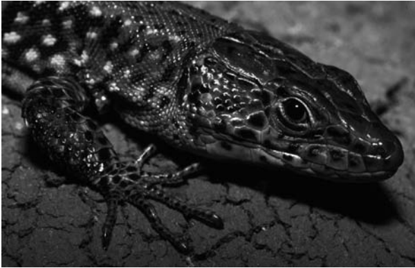
Fig. 17. Adolfus jacksoni from Kakamega Forest.