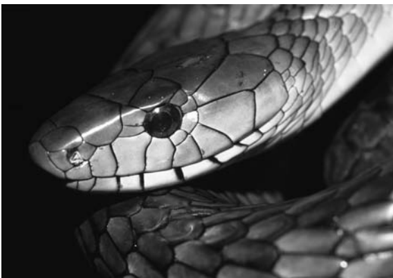
Fig. 23. Dendroaspis jamesoni kaimosae from Kakamega Forest.