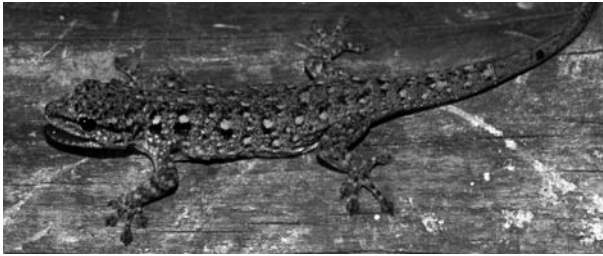
Fig. 14. Lygodactylus gutturalis from Kakamega Forest.