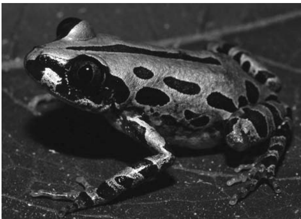
Fig. 6. Kassina senegalensis from Kakamega Forest.

Remarks: NMK A/3858, A/4012 and ZFMK 81744 are from the Buyangu area. This taxon was reported by LÖTTERS et al. (2006) as Hyperolius aff. cinnamomeoventris .