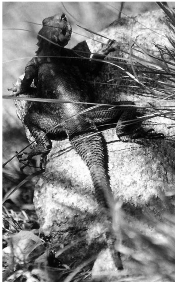
Fig. 10. Agama kaimosae from Ngoromosi/ Nandi escarpment.

The diagnoses of the subspecies of A. atricollis by KLAUSEWITZ (1957) are not adequate. Therefore, the material is only preliminarily assigned to the subspecies ugandaensis because Kakamega Forest is geographically closer to the area of this subspecies than to minuta , according to KLAUSEWITZ's (1957) map: A. a. minuta inhabits Ethiopia and eastern Kenya, while A. atricollis ugandaensis occurs within Uganda and western Kenya.