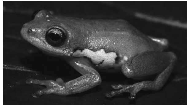
Fig. 4. Hyperolius lateralis from Kakamega Forest.

Remarks: NMK A/3103, A/3867, A/4011, A/4026 and ZFMK 81745-746 were from the Buyangu area. NMK A/4065 was collected at the BIOTA Campsite. Details on the other vouchers are unknown.