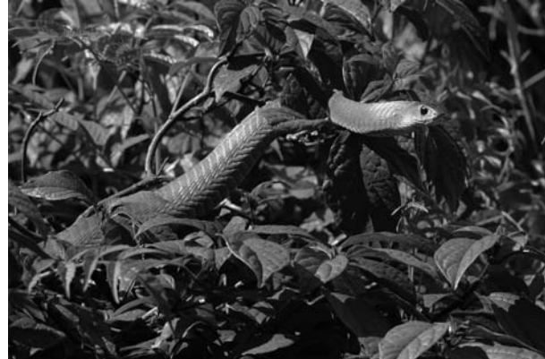
Fig. 19. Dispholidus typus from Kakamega Forest.

Specimens examined. NMK O/2715; ZFMK 82053.