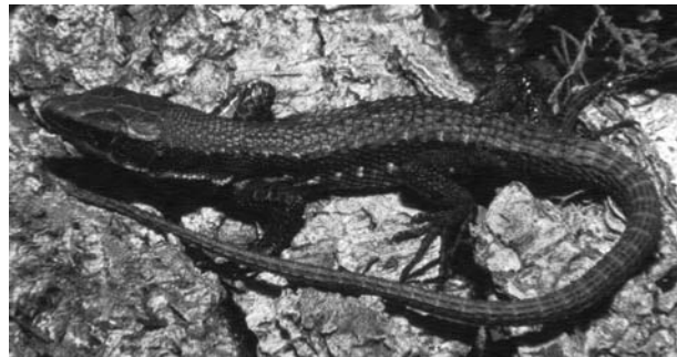
Fig. 16. Adolfus africanus from Kakamega Forest.

Remarks: T. striata is one of the species with the highest density in Kakamega area and was found everywhere outside the forest or wooded areas. But meanwhile the species has reached the BIOTA Camp, located on a small clearing of Udo's Campside inside the forest. Here and on the houses of the near villages it is sympatric with Adolfus jacksoni (Lacertidae) and only on the houses also with Acanthocercus atricollis (Agamidae). In contrast to the data given by RAZZETTI & MSUYA (2002) and SPAWLS et al. (2002), T. striata was never found on trees or in plantations. The diet analysed by FINK (2003) is dominated by Coleoptera and also consists of other winged insects, collembolans, spiders, nematodes and molluscs.