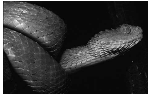
Fig. 25. Atheris squamigera from Kakamega Forest.

(HUGHES & BARRY 1969) in the west to Kenya in the east, southwards to Angola and Tanzania. Additionally studies may demonstrate differences between the populations. In Kenya A. squamigera is, with two exceptions, only known from Kakamega Forest. Two records are from outside the forest: one specimen from Chemilil and one sighting from the Soit Ololol Escarpment (SPAWLS et al. 2002). Specimens collected in this study were exclusively found near water bodies in the Buyangu area. They were found by hunting by torchlight and basking on small bushes or in leaf litter at daytime.