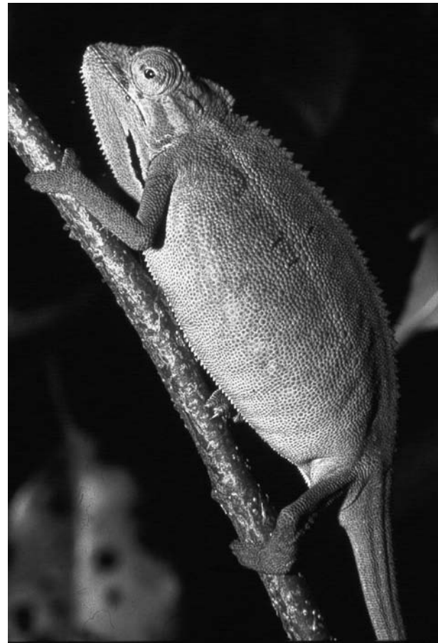
Fig. 11. Chamaeleo ellioti from Kakamega Forest.

Remarks: This voucher was collected in Kakamega town, so it is possible that the species also occurs in the surrounding area of Kakamega Forest.