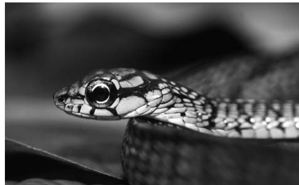
Fig. 22. Thrasops aethiopissa from Kakamega Forest.

Remarks: This taxon is only known from literature (SPAWLS et al. 2002). Further data are not available.