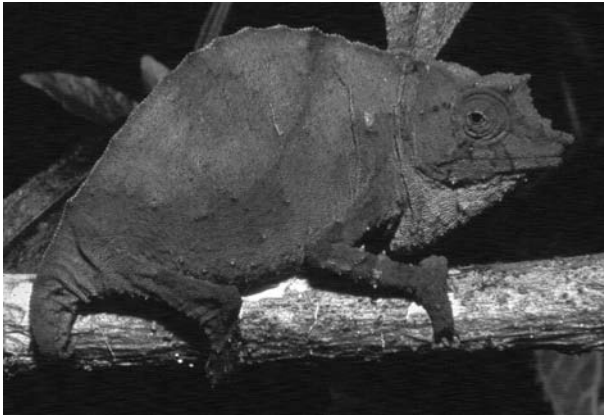
Fig. 12. Rhampholeon boulengeri from Kakamega Forest.