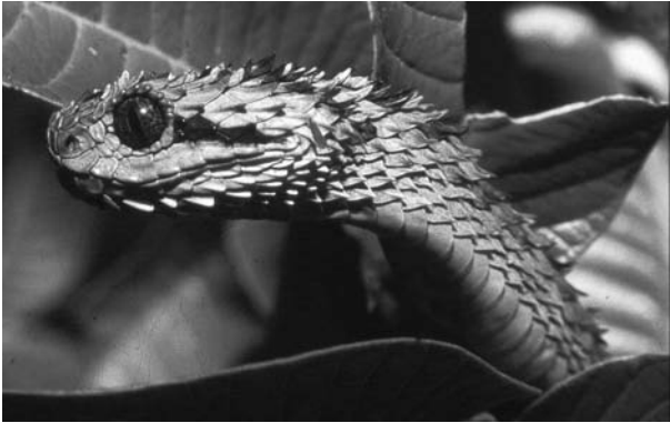
Fig. 24. Atheris hispida from Kakamega Forest.