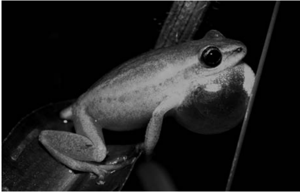
Fig. 5. Hyperolius cinnamomeoventris from Kakamega Forest.

Remarks: Details on the vouchers are unknown, but most are from the Buyangu area. H. viridiflavus is the most common frog inside the forest. Specimens were observed at different ponds and also clearings for example, the BIOTA field camp, where several specimens were sitting inside the lavatory. NMK A/1193/1-2 were from Malava forest.