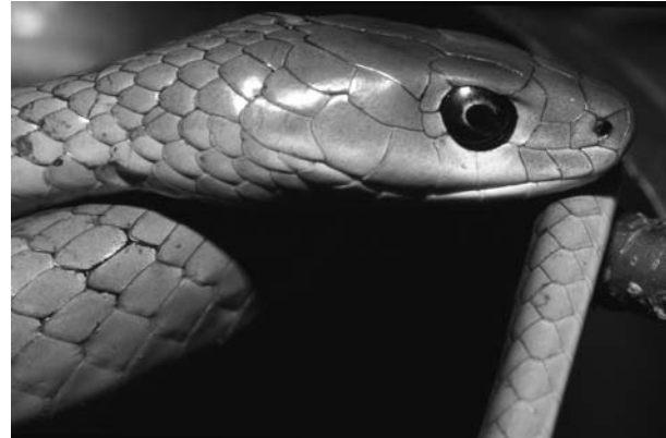
Fig. 20. Philothamnus battersbyi from Kakamega Forest.

Remarks: Philothamnus is probably one of the most difficult, for the taxonomists, reptile genera in Africa. But P. battersbyi is relatively easy to identify by the uniform green colouration, two supralabials entering the eye, a divided anal scale, 15 midbody scale rows and no keels on the subcaudal scales. It can only be confused with the likewise uniform green P. angolensis . Most vouchers collected within the study were found in Buyangu Village basking on small bushes. One was found killed on the road.