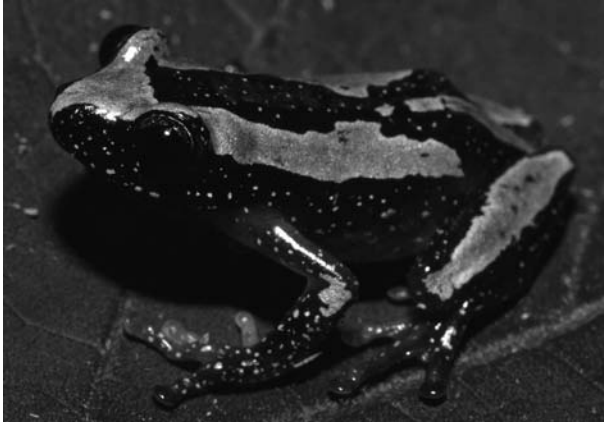
Fig. 3. Afrixalus osorioi from Kakamega Forest.

Additional specimens. A/3928, A/4017, A/4316/1-7.