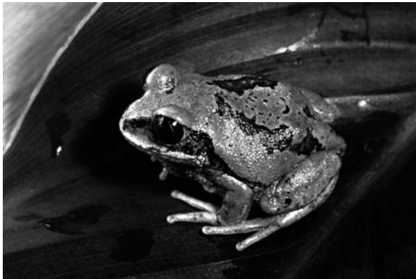
Fig. 8. Leptopelis aff. bocagii undescribed form from Kakamega Forest.