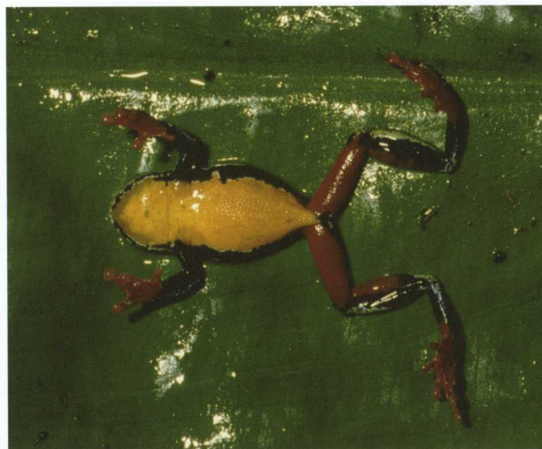
Fig. 3. Ventral view of female paratype (in PhF) of Hyperolius dintelmanni sp. nov. (ZFMK 67890).

Description of holotype: Body slender with sacrum width about one sixth of SVL; head short and broad with distance from tip of snout to posterior corner of eye about one fourth of SVL; HW about one third of SVL; snout tip in dorsal and lateral views rounded; nostril dorsolateral, protruding and visible from above; cho-