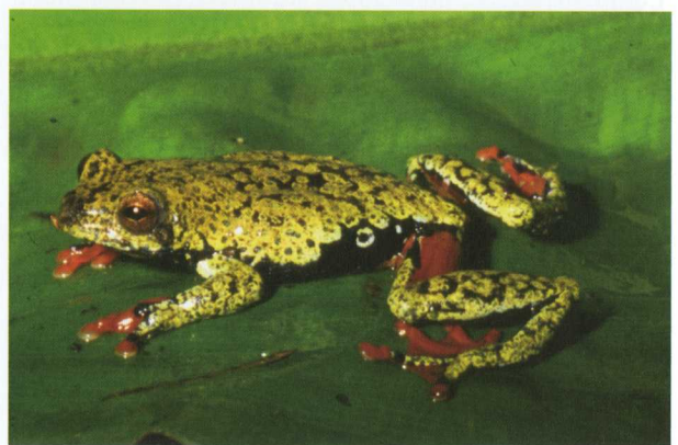
Fig. 2. Lateral view of female paratype (in PhF) of Hyperolius dintelmanni sp. nov. (ZFMK 67890).