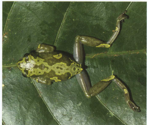
Fig. 1. Dorsal view of male holotype (in PhJ) of Hyperolius dintelmanni sp. nov. (ZFMK 67871).