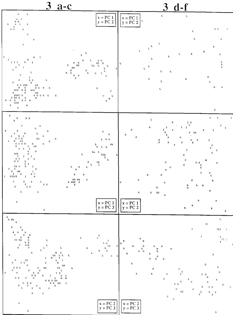
Fig. 3: Plots 1–3. 3 a–c shows plot 1, 3 d shows plot 2 (first projection only), 3 e–f shows plot 3, first (3 e) and third (3 f) projections. A = S. alpinus , C = S. coronatus , G = S. granarius , I = S. isodon , K = S. caecutiens , L = S. minutus , M = more than one individual (or for the variable plots, more than one variable) in the same spot, R = S. samniticus , S = S. araneus , V = S. minutissimus .